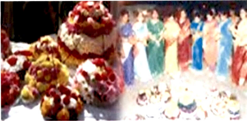
6.48. Batukamma i-flower arrangement