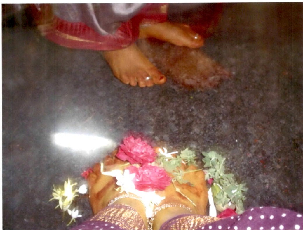
6.32. Nine Suhagan women are offered auspicious objects at Savitri-Gauri worship