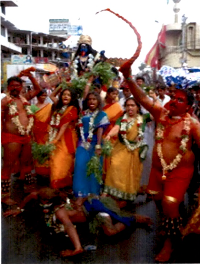
6.45. Potharajulu -known as brothers of goddess