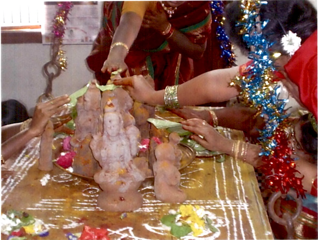
6.23 Invoking the goddess