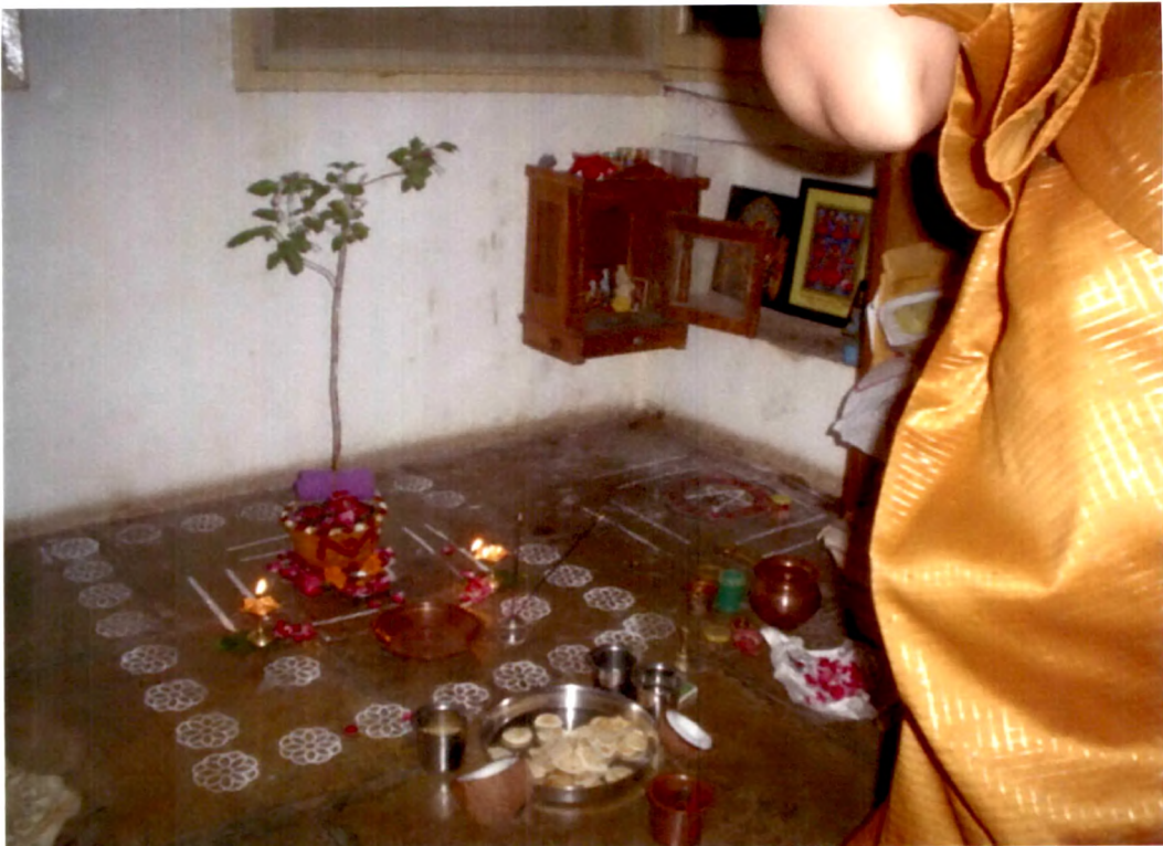
6.4 Offering 33 full moon worship-through Tulasi