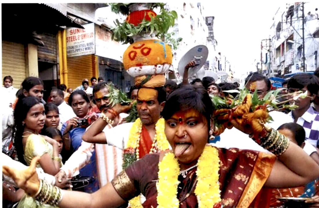
6.44. Bonalu by a devotee on ecstasy