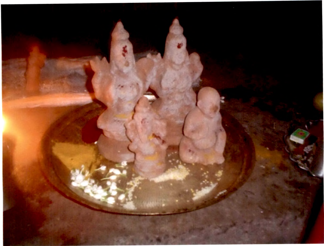
6.21 Savitri, Gauri, Panchagn Brahmin, Ganapati