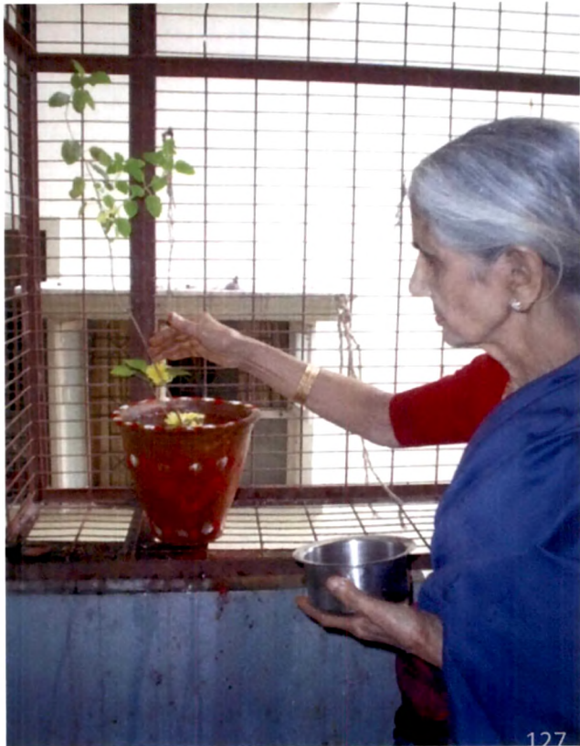
6.2 Daily worship of Tulasi plant