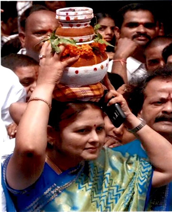
6.41. Bonalu carried by Jayasudha- film star of yester years