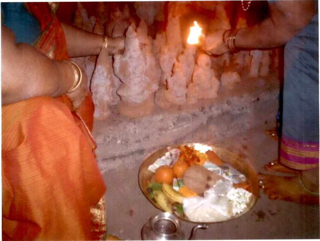
6.15 Potter selling unbaked clay idols