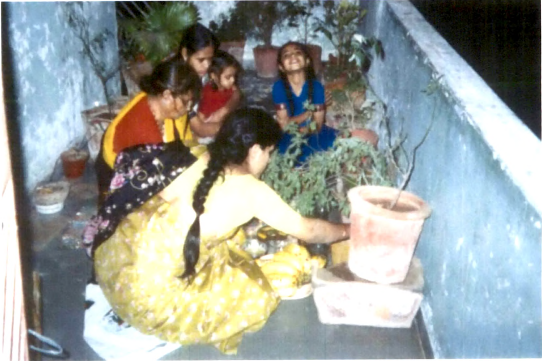
6.3 ' Ksheerabdi Dvadasi ' marrying Tulasi with lord Krishna on 12th day after Diwali