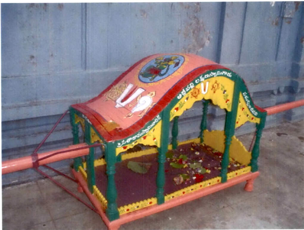
6.10. Palanquin to carry the gods' idols on Sankranti day