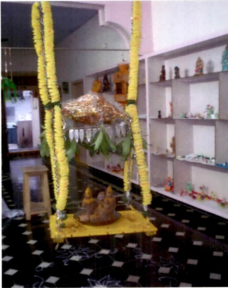
6.35 Smt.K.Rama's clay idols on a swing