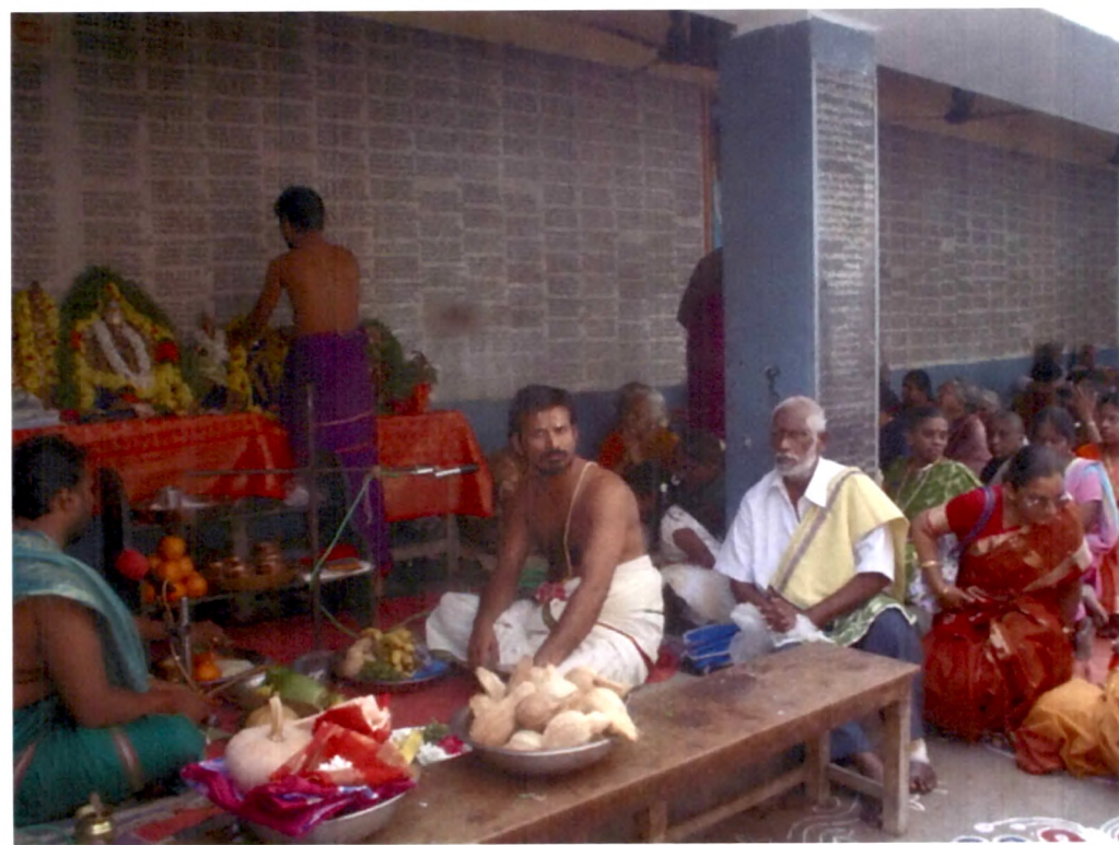
6.12 Dhanurmasam worships at the temple