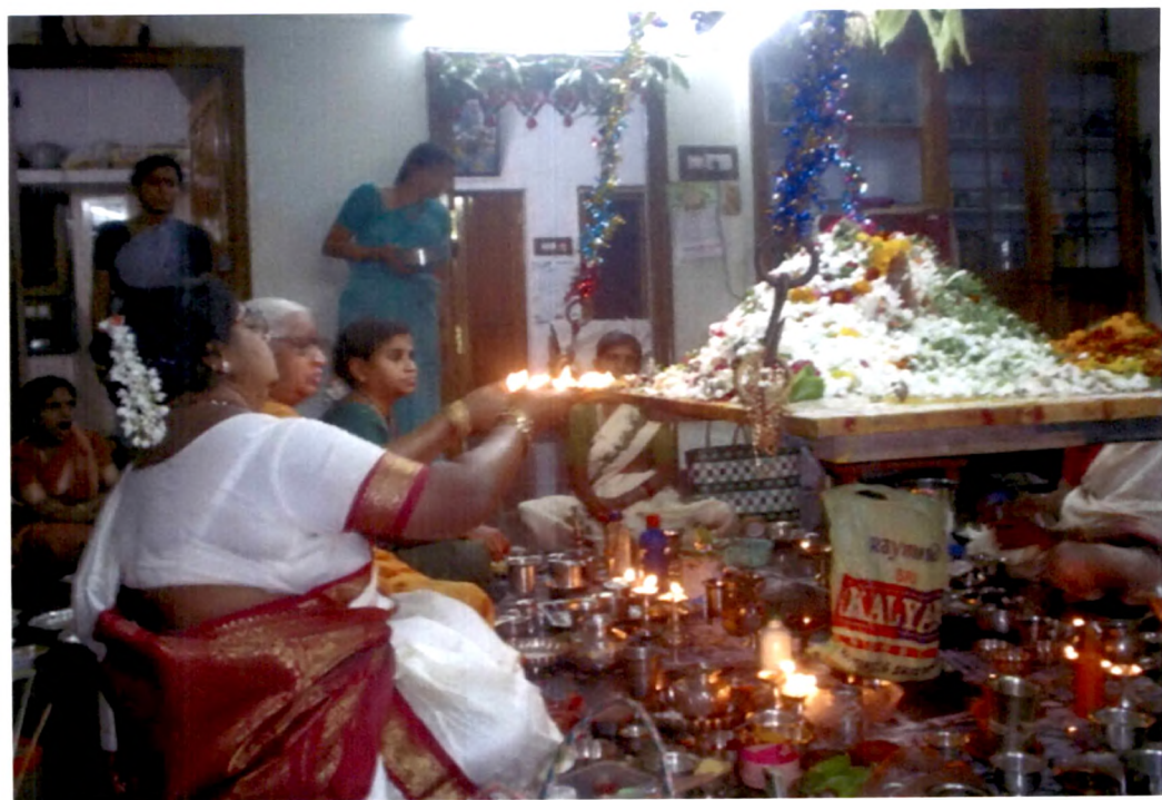
6.30 Evening worship