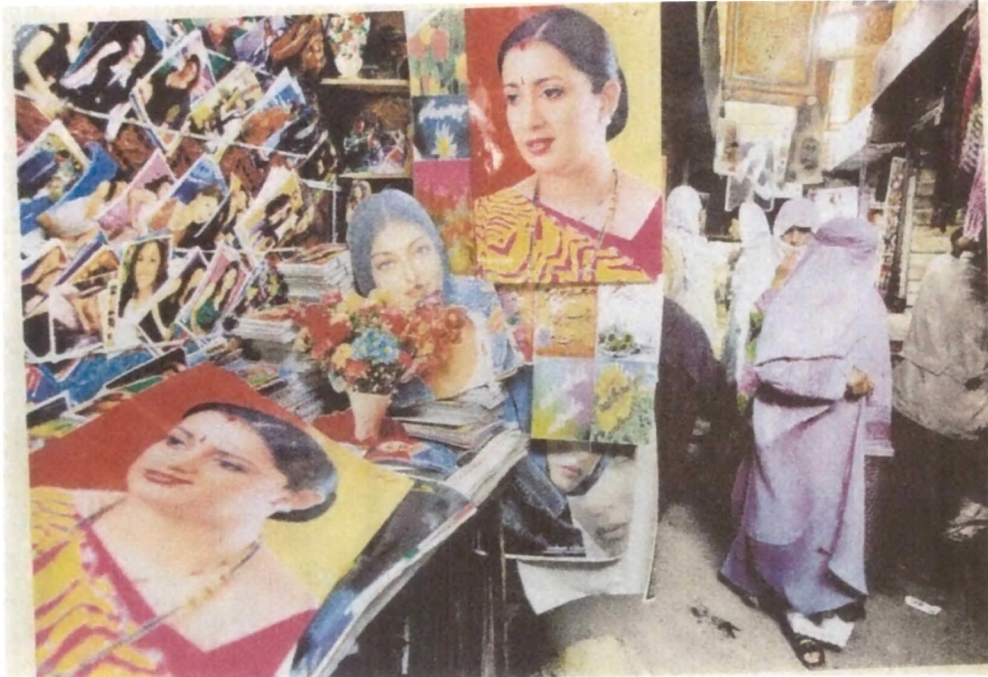
6.39. Photographs of Smriti Irani are popularly found who is named Tulasi