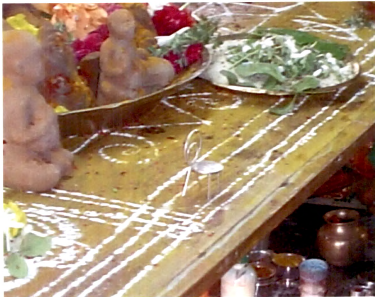
6.26.offering a seat to the goddess