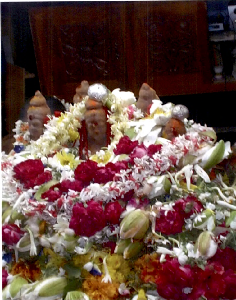
6.29 Worshipping with various flowers