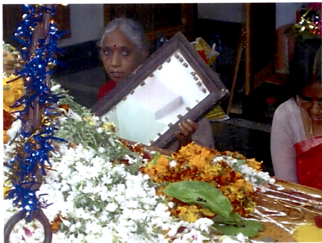
6.28.Showing a mirror to the goddess