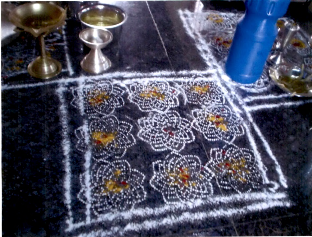
6.25.Nine lotui Rangoli to symbolize nine days and nine years of worshipping Savitri-Gauri