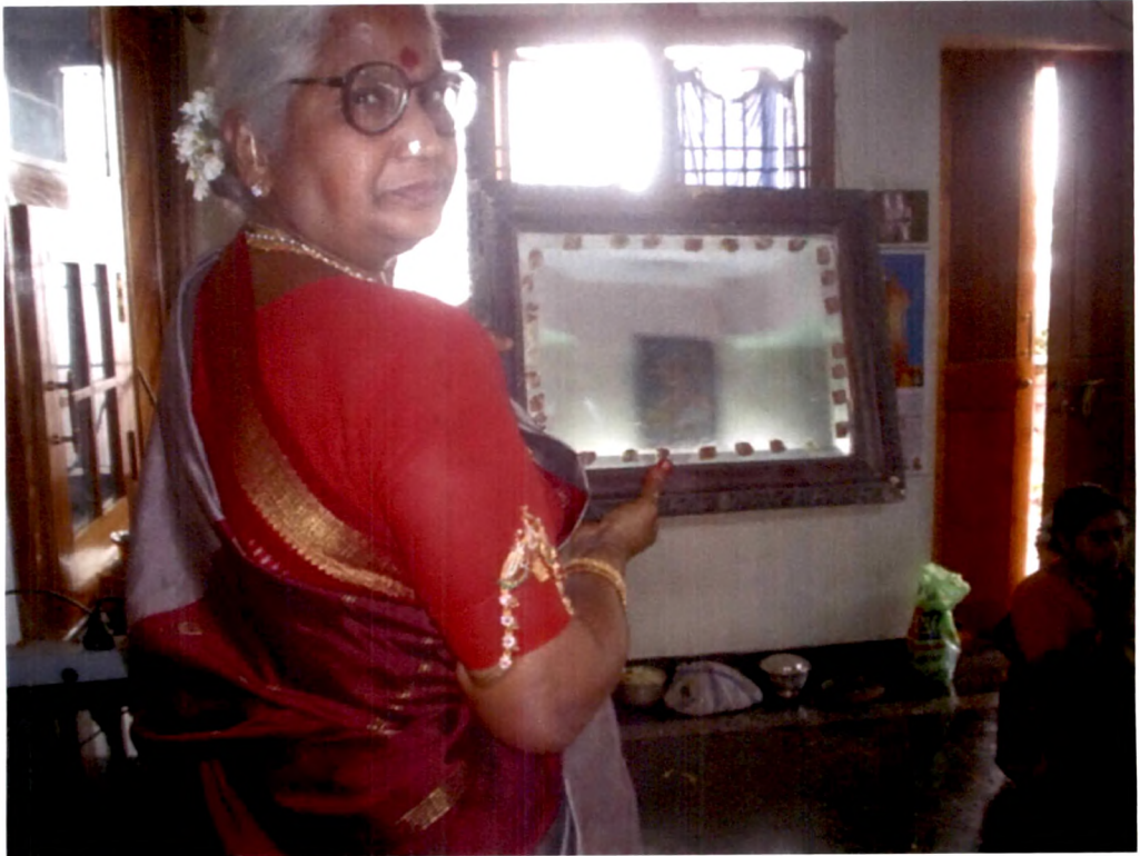
6.27.Showing a mirror to the goddess and co-worshippers as a process of worship