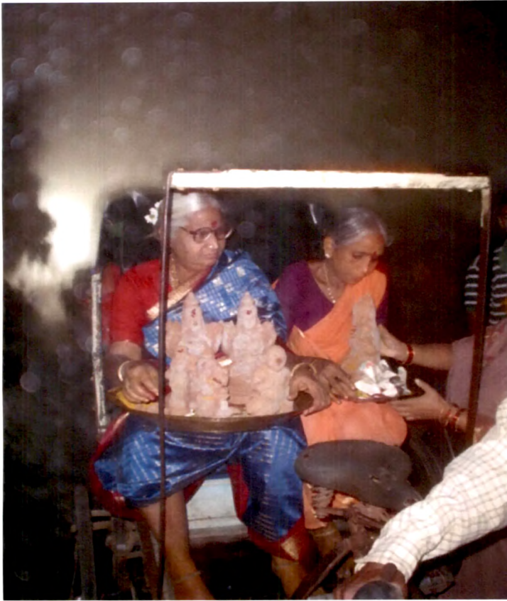
6.17.Carrying the idols with care