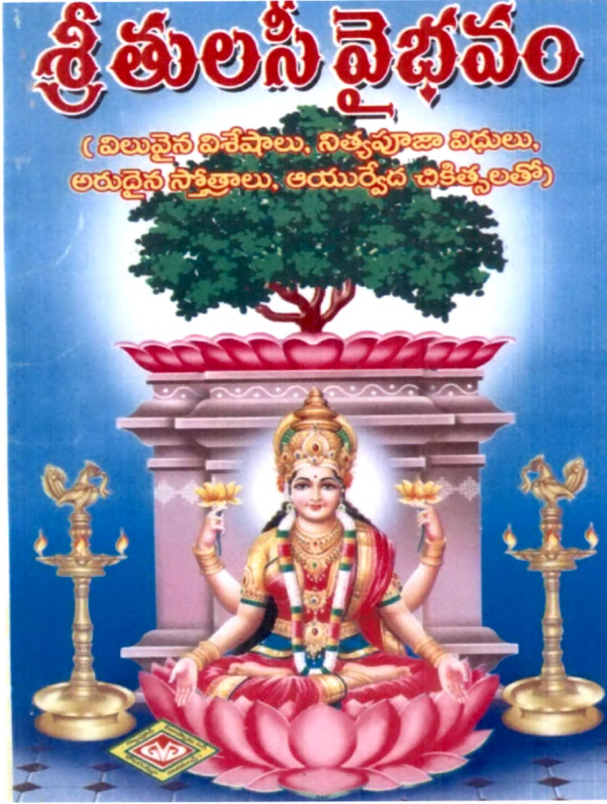
6.1 A booklet of procedure to worship goddess Tulasi