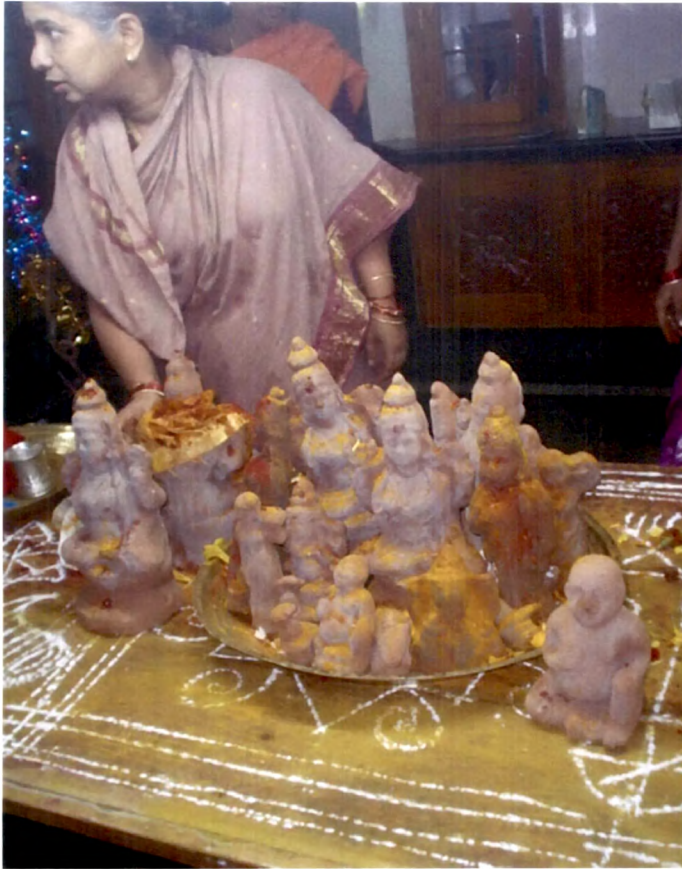
6.19 Clay idols are placed on the swing