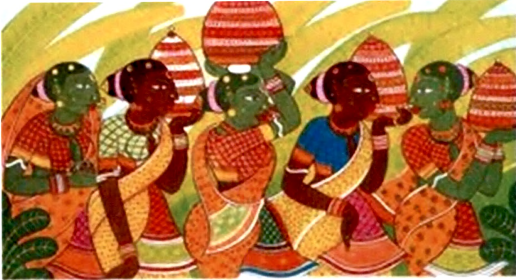
6.47.K.Rajaih painted Batukamma