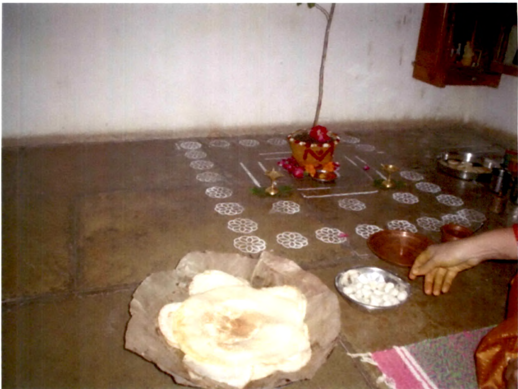
6.6 Pan cakes and the rice flour and jaggery dough for the special lights