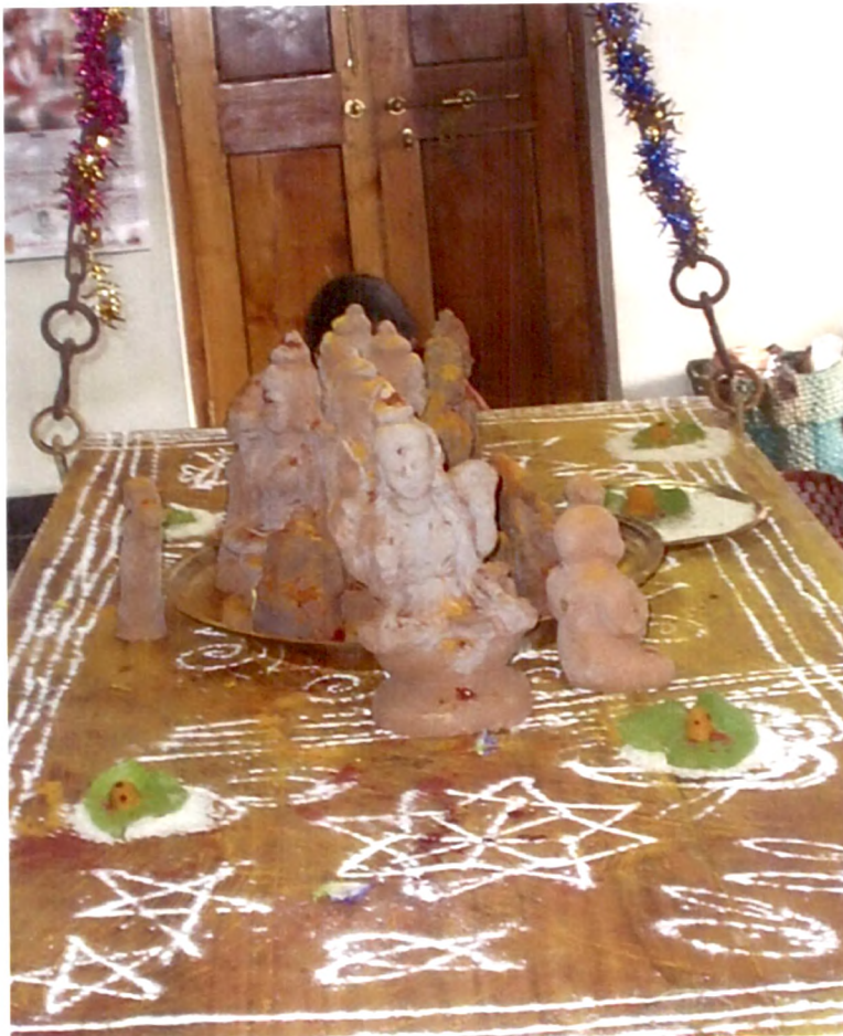
6.22. Placing the idols on a swing