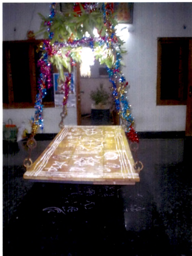
6.18.Swing at the centre hall kept ready to place the clay idols