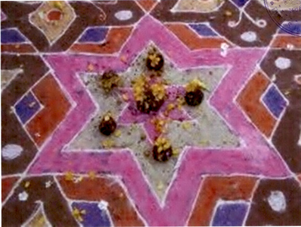
6.49. Gobbeema in huge Rangoli