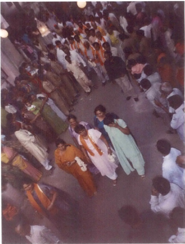
6.40.B.J.P. political leaders and illustrious personalities on Tulasi worship day in Baroda