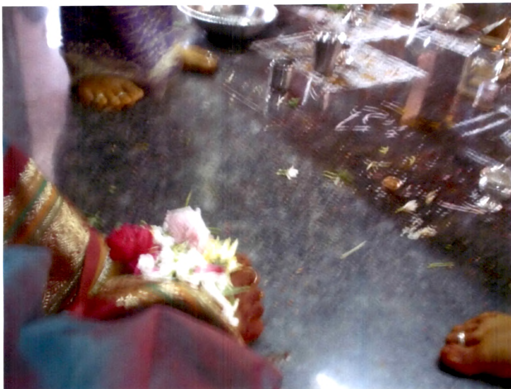
6.31. Worshipping the feet of Suhagan