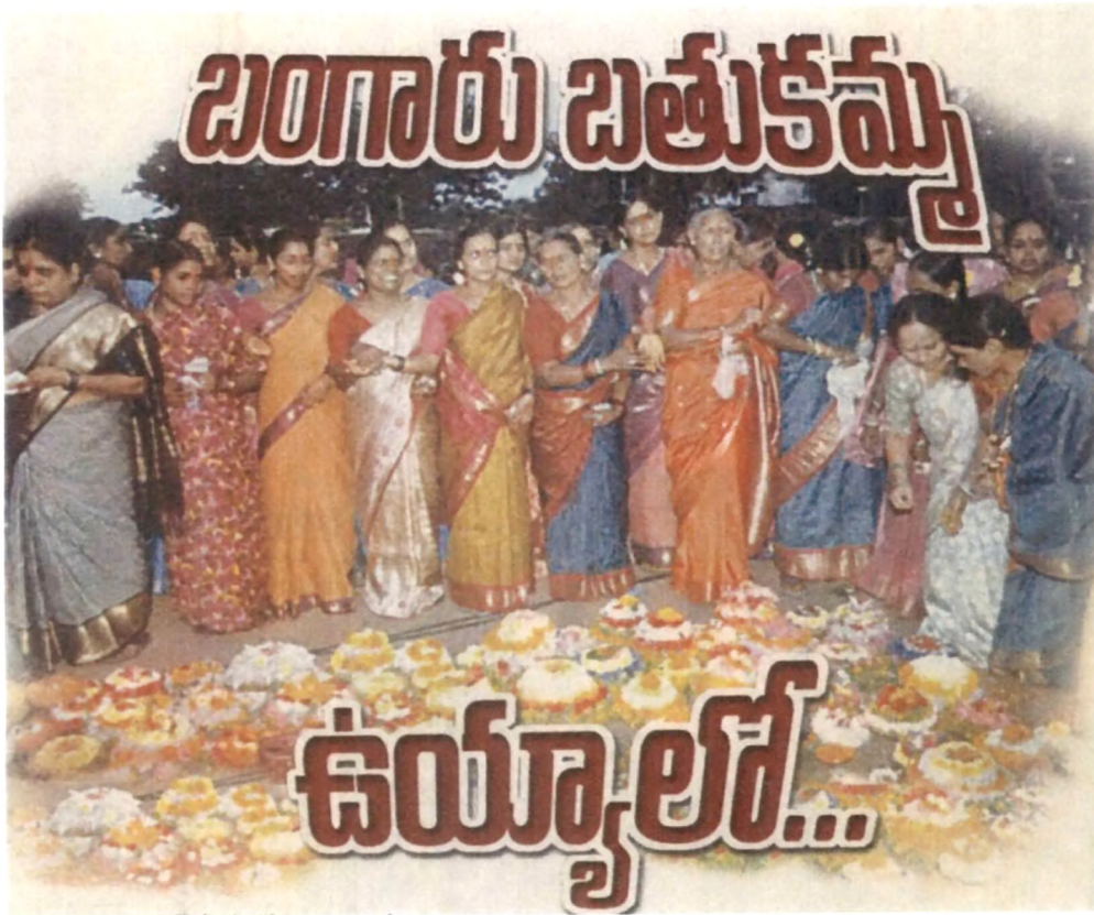
6.9. 'Batukamma festival at the time of Navaratri in Telangana