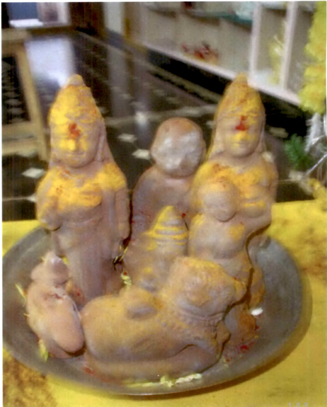
6.36.Clay idols at Smt.Rama's place