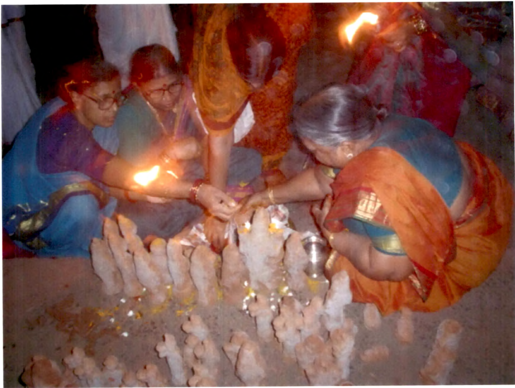
6.16 Selecting idols