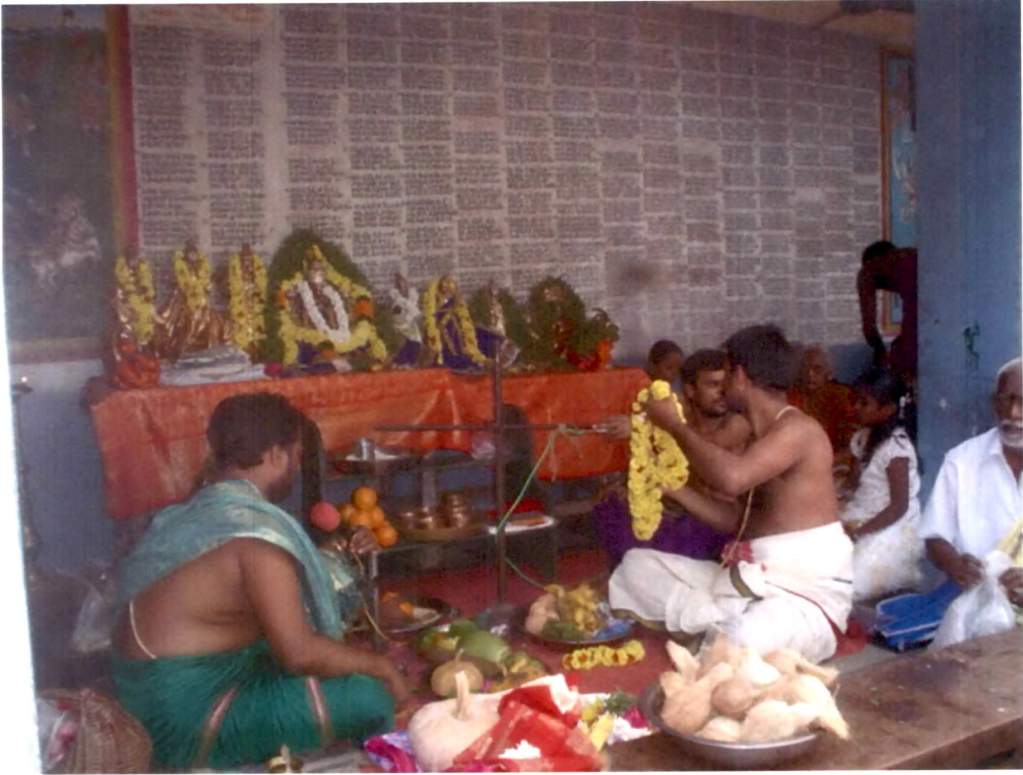
6.11 Preparing idols for a procession in the palanquin