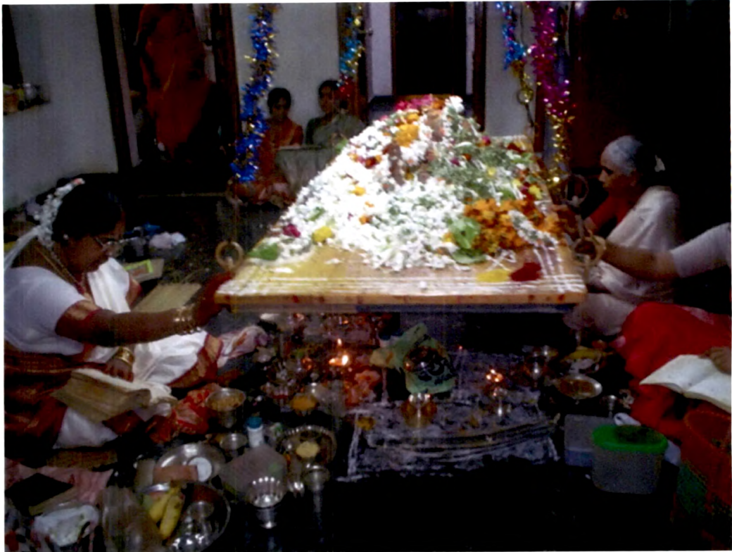
6.33. Bidding goodnight to the goddess at evening worship