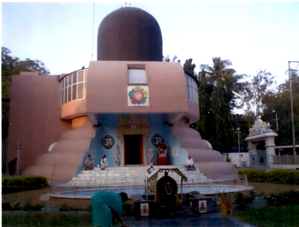
7.1.Woman devotee sweeping at Sivam-Satyasai temple in Hyderabad