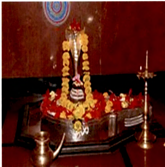
7.10. Lord Veerabhadreswara [worshipped on Gurunadhudi Pongallu ] [from web page]