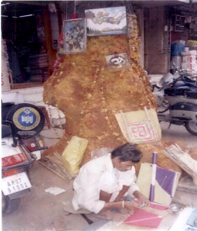
7.9. Neem tree applied turmeric by a sieve vendor