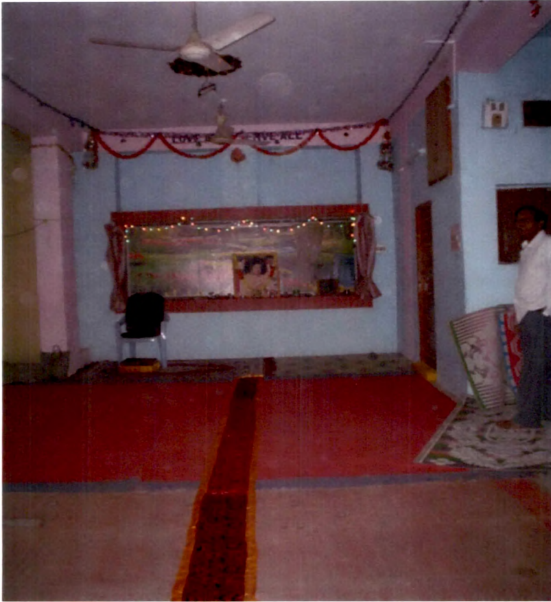
7.5. Ishtadevata worship-home shrine of a Satyasai devotee