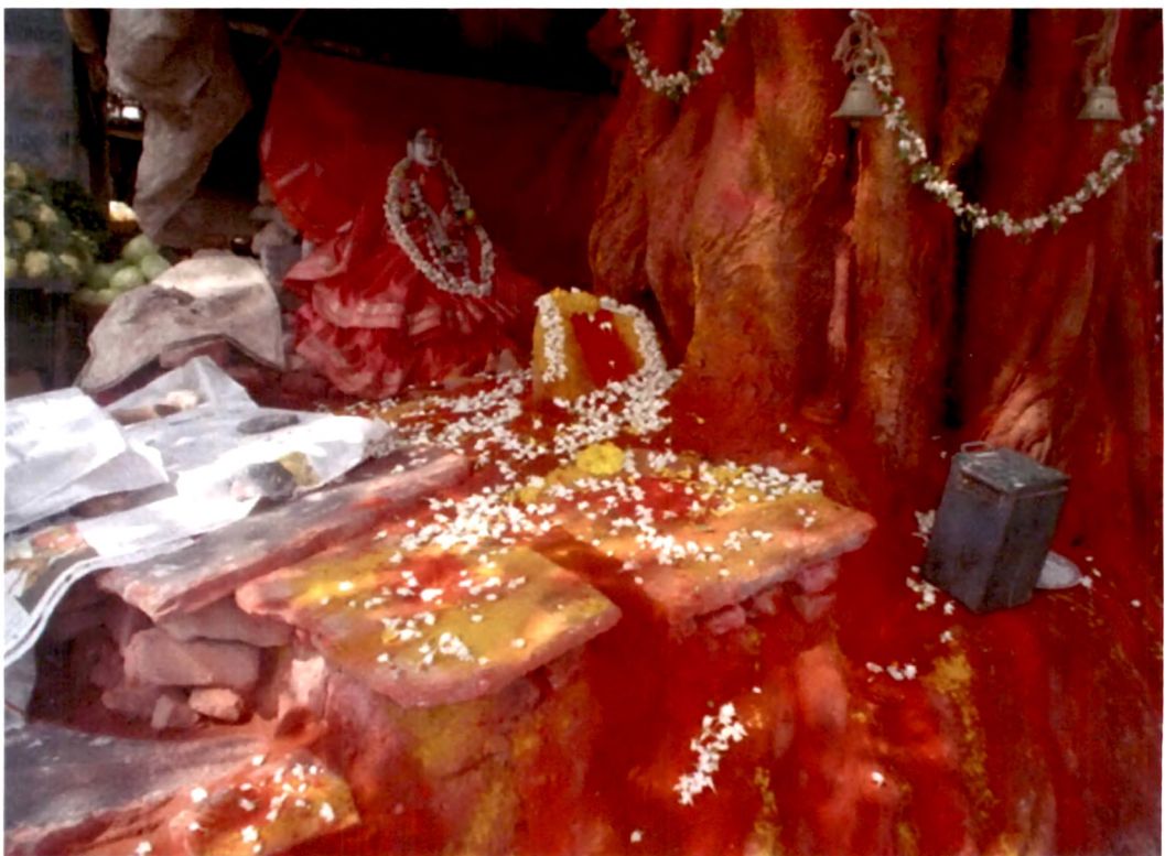
7.8. Goddess installed at tree trunk near vegetable market-Amaravati