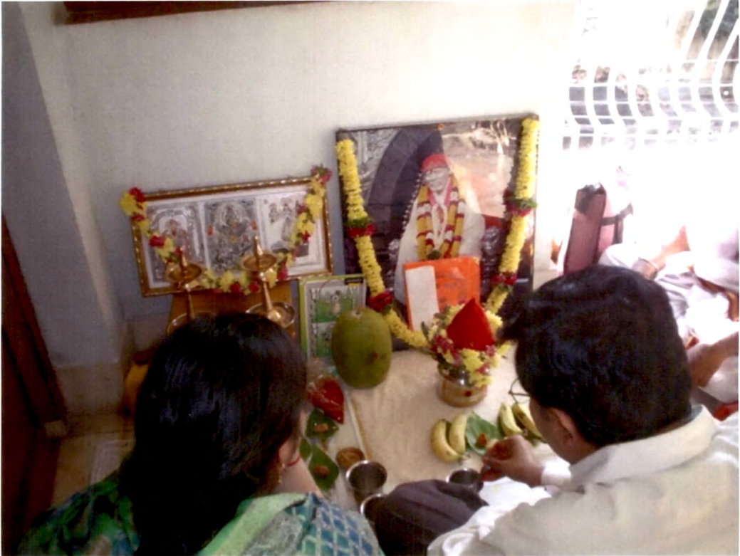
7.7. Ishtadevata worship after entering new work premise