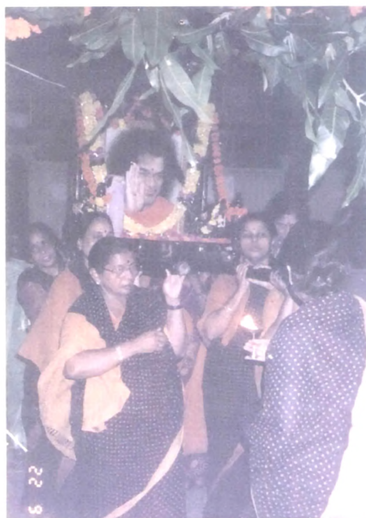
7.2. Satyasai-Naaridal -palanquin procession