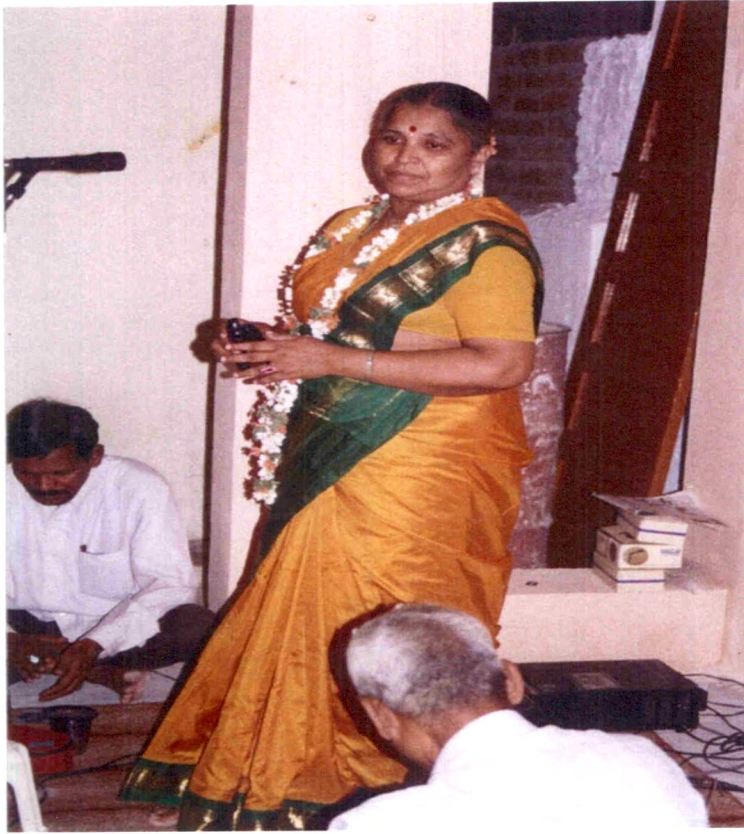
7.11. Harikatha by a woman narrator.