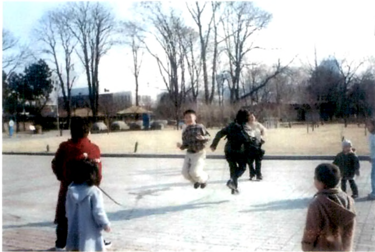
Plate 1.1 Visitors playing rope-jumping in NFMK ground

A museum is one of the important social education centers. People are expected to learn throughout their life under changing circumstance of the society. The Museum is organizing education programmes related to one of the government education policies i.e “life-long learning”. It covers all age groups from young children to old people and the Museum provides the play kits in the Museum ground. For example, Traditional Costume-making Class; Korean Folk Lecture for Teachers; Korean Folk Arts Performance for Visitors , etc. The Museum always provides the traditional Korean playing kits such as tops, rope-jumping, shuttlecocks, etc. for young children, older children and others in the Museum ground. Everybody enjoys the games and plays. Through these traditional plays, the young children learn about how to play from their parents and other adults. Thus they realize how their ancestors enjoyed the leisure time in the past.