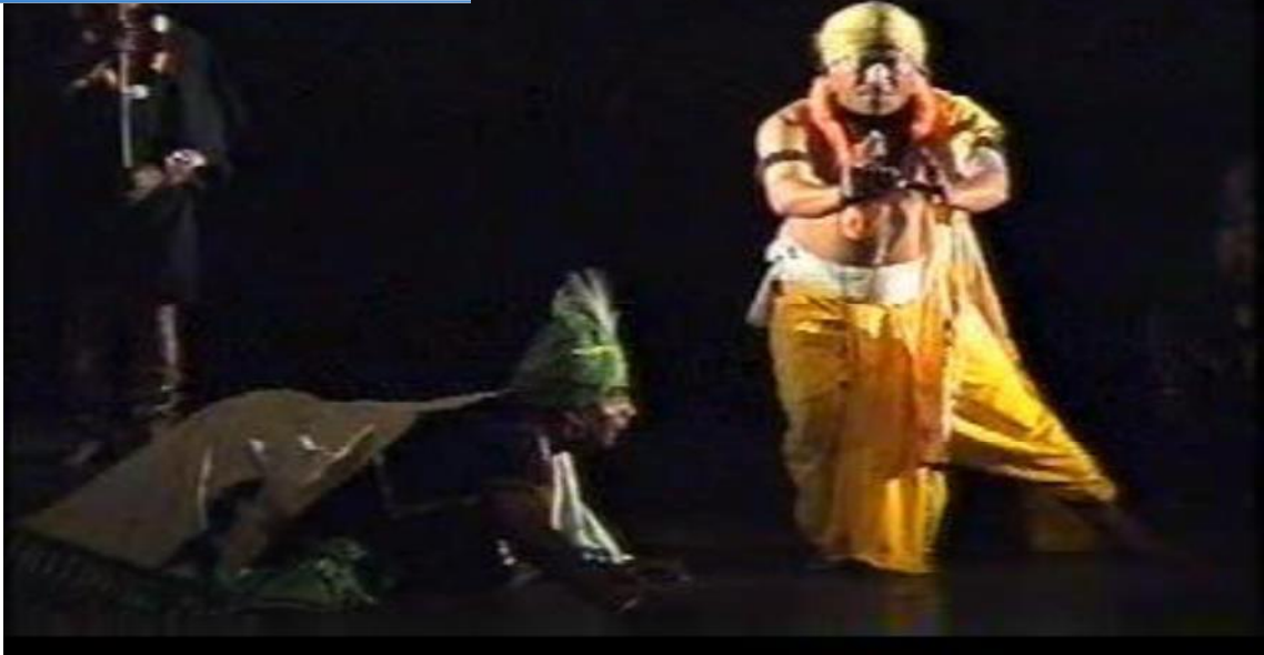
Natyashashtric Hand Gesture's and movement of Than Ta use in a play Chakravyuh by Ratan Thiyam