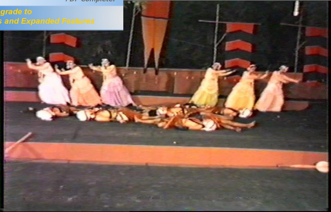
A scene from Urubhangam by K N Panikkar use of Mohiniattam

Click Here to upgrade to Unlimited Pages and Expanded Features