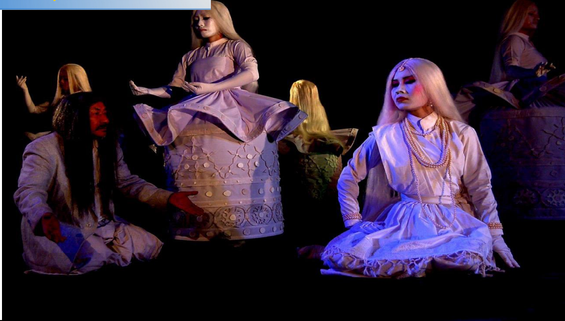
Manipuri Raas costume and posture with the use of lights and colors in the Play When we Dead Awaken.