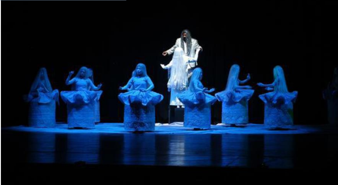
Composition of play “When We Dead Awaken “ when they go to heaven by Ratan Thiyam