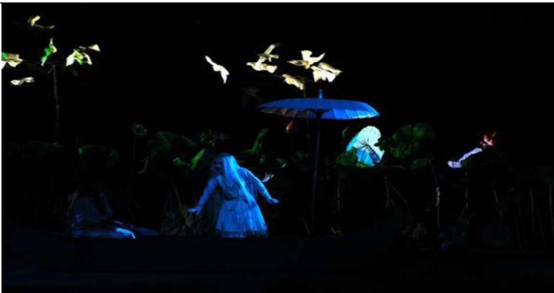
Example of the use of modern technology in play When We Dead Awaken by Ratan Thiyam. Boat in the river passing through different places.