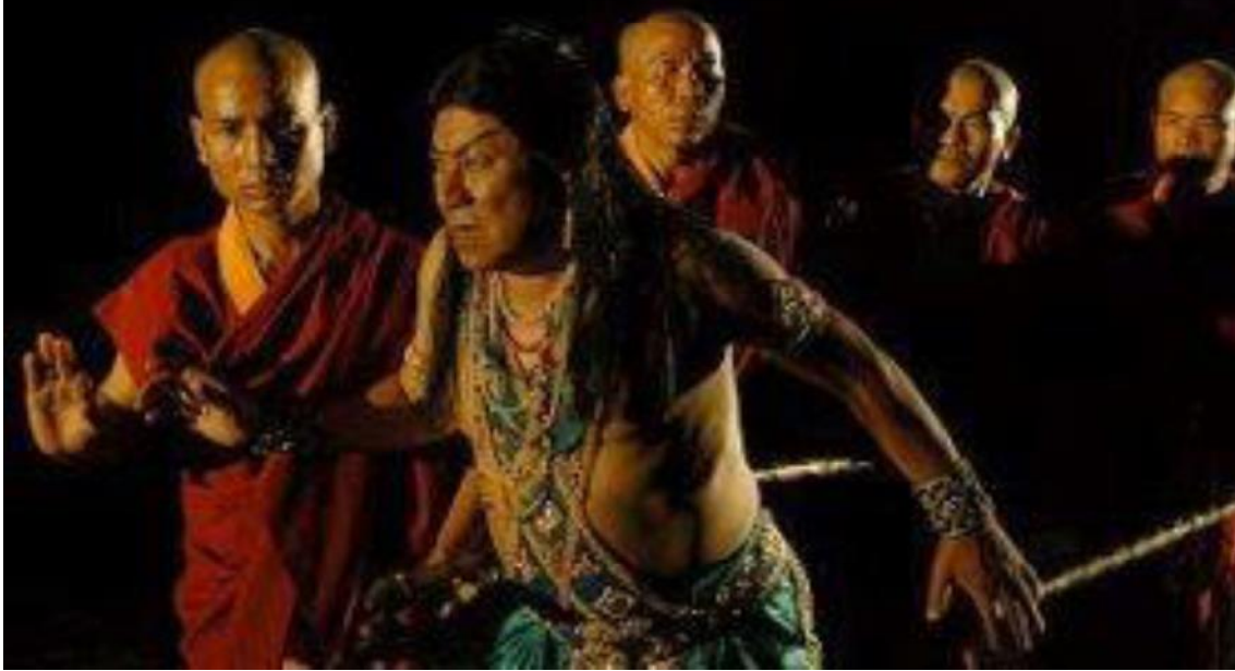
A scene from the play Uterpriyadarshi by Ratan Thiyam