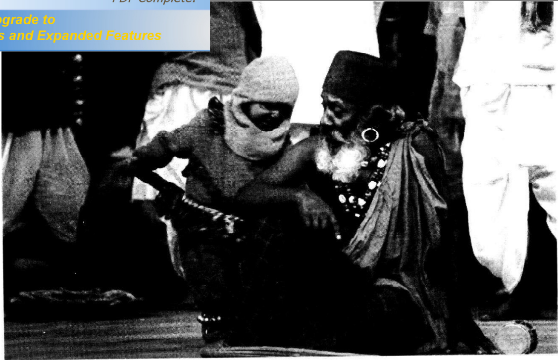
A scene from Agra Bazar by Habib Tanvir