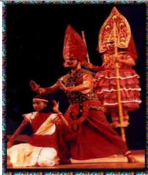
Urubhangam by K N Panikkar – use of Theyyam