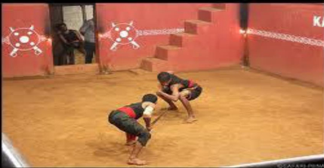
Origianl Photo of Kalaripaytu