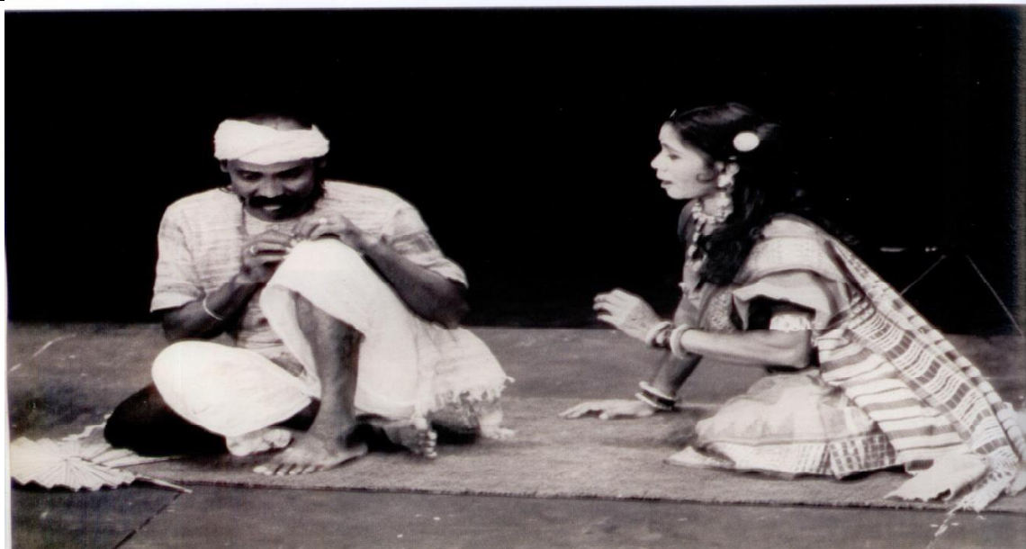
A scene from Charandas Chor by Habib Tanvir