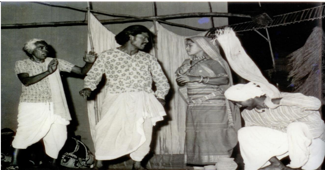
A scene from Bhadur Klarin by Habib Tanvir