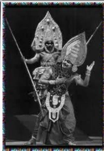
Original Theyyam used in Urubhangam by K N Panikkar