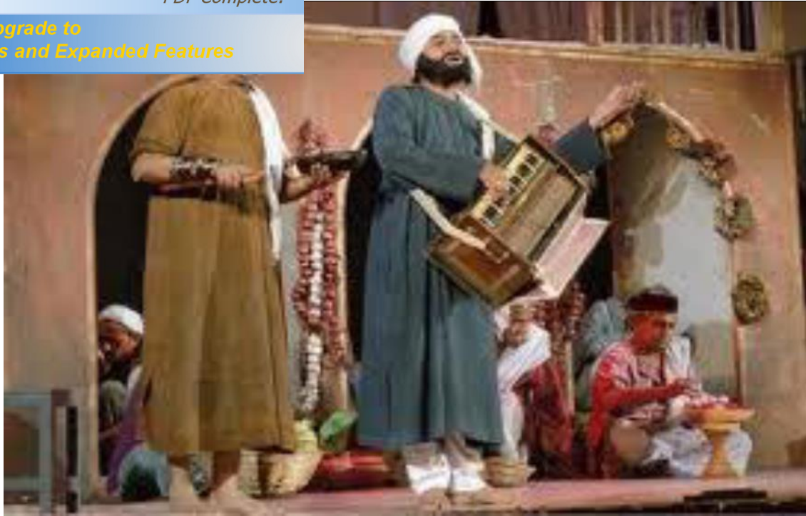
A scene from Agra Bazar by Habib Tanvir