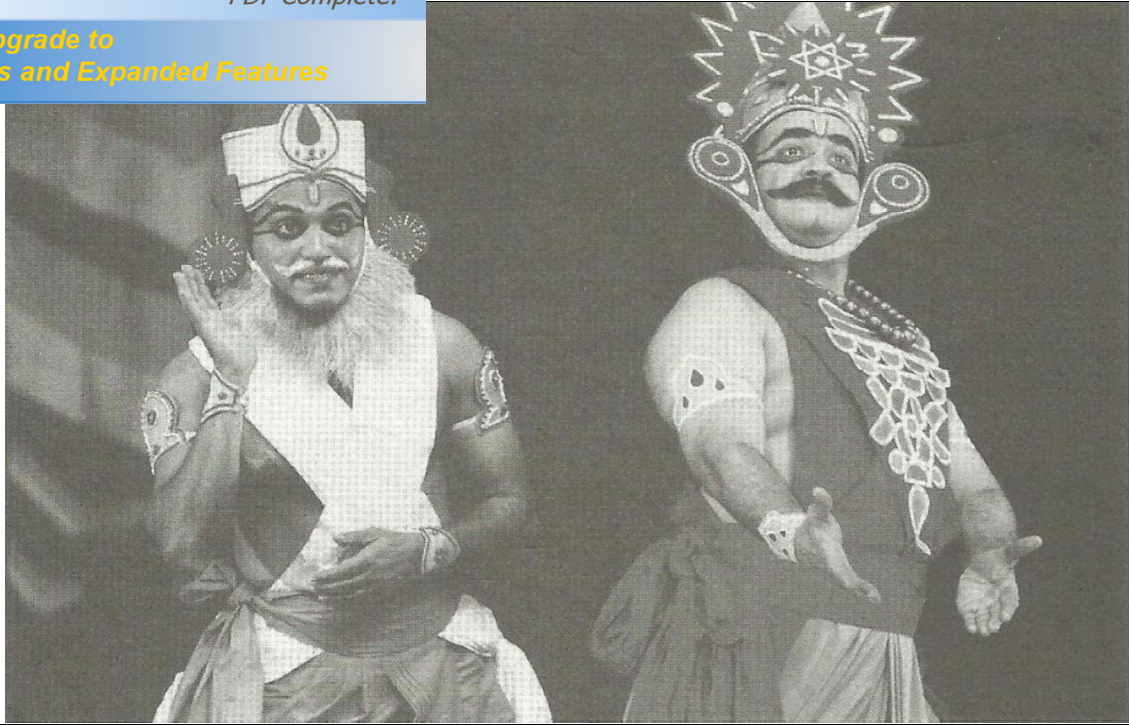
Karnabharam by K N Paniikar performed by Mohanlal

Click Here to upgrade to Unlimited Pages and Expanded Features