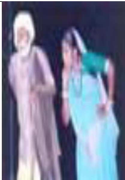
A scene from Original Nacha Performance