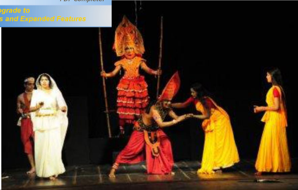
Urubhangam by K N Panikkar