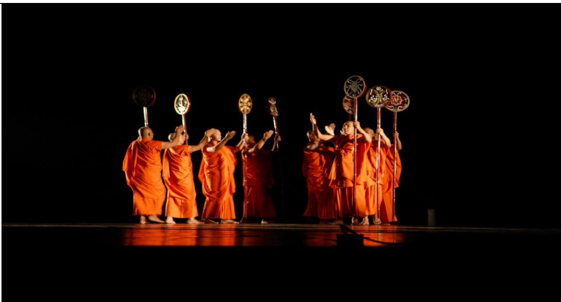
A scene from the play Uterpriyadarshi by Ratan Thiyam