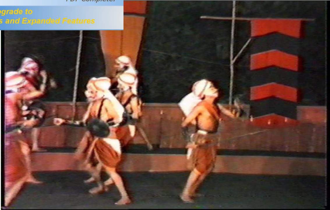
A scene from Urubhangam by K N Panikkar use of Kalaripayattu

Click Here to upgrade to Unlimited Pages and Expanded Features