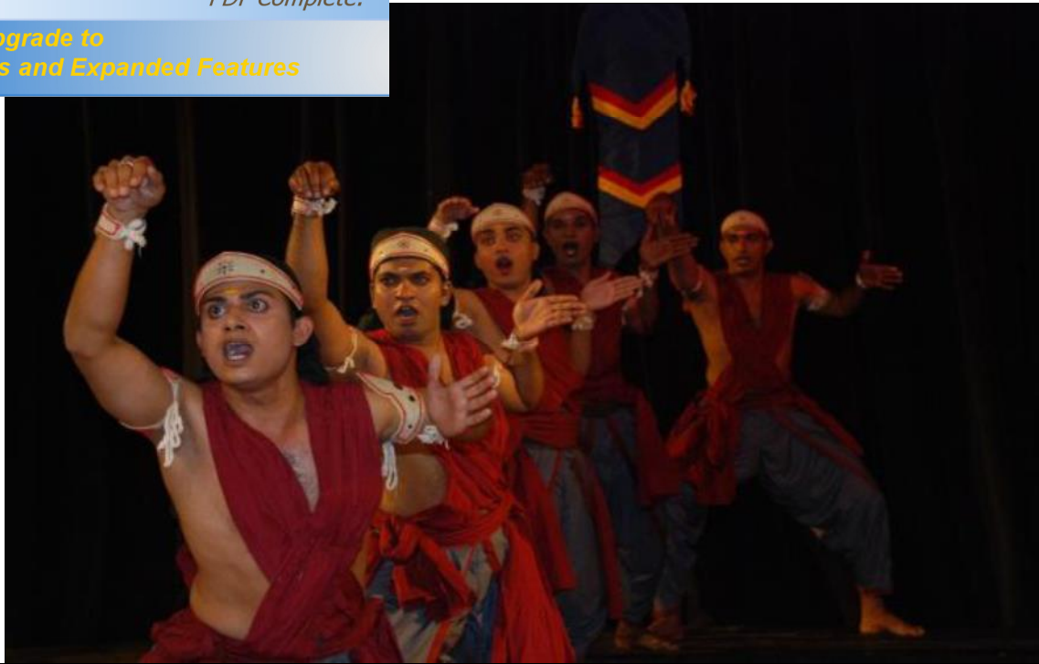
Karnabharam by K N Paniikar

Click Here to upgrade to Unlimited Pages and Expanded Features