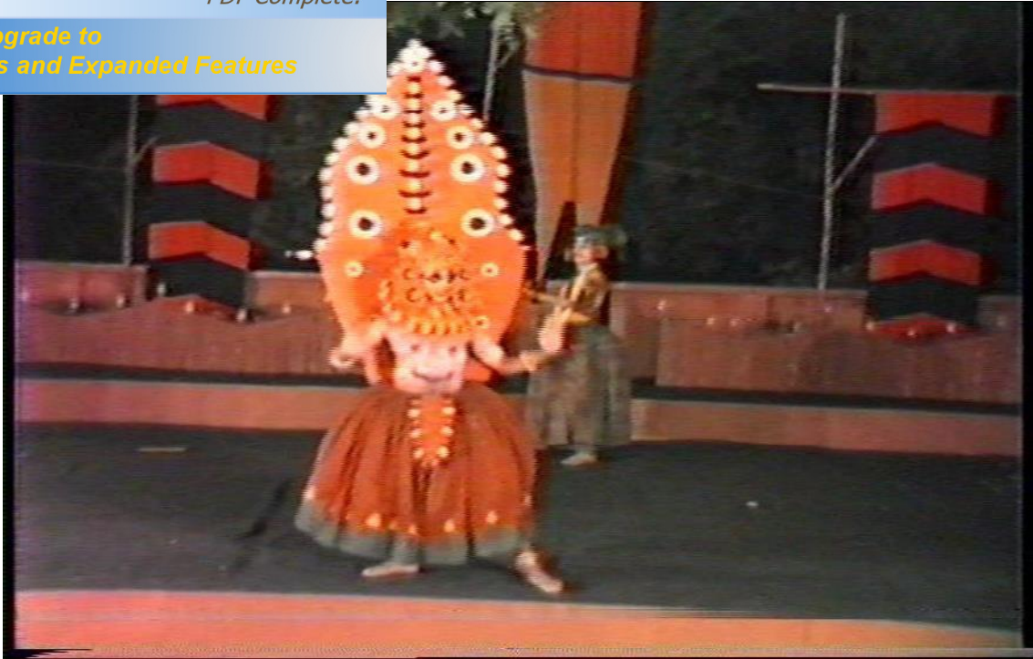
A scene from Urubhangam by K N Panikkar use of Theyyam