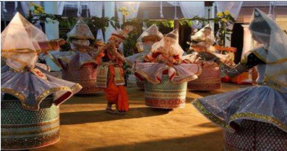
This is the original photograph of Manipuri Raas. In above photo of Play When we Dead Awaken has the same movement and Hand gesture and posture.