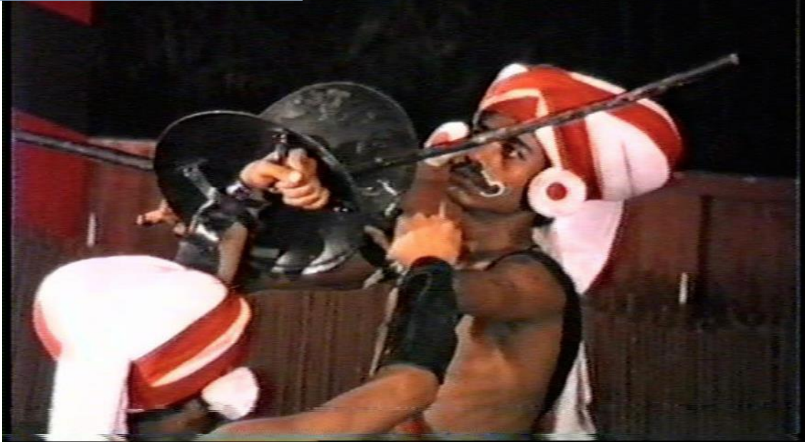
A scene from Urubhangam by K N Panikkar use of Kalaripayttu

Click Here to upgrade to Unlimited Pages and Expanded Features