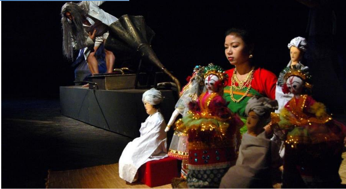
Symbolic Representation of the three doll reflect the Triangle of their relations in play When We Dead Awaken by Ratan Thiyam