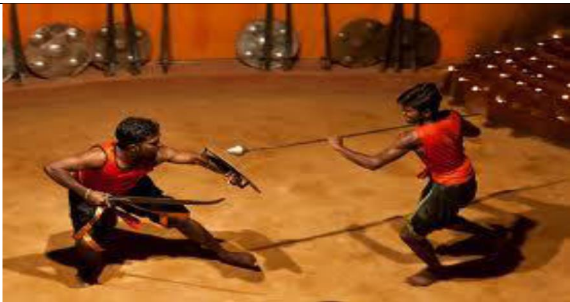
Origianl Photo of Kalaripaytu