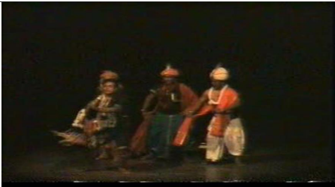
Scene from Chakrvuyh where Yudhisthir convincing Abhiminyu to break the Charavuyh.