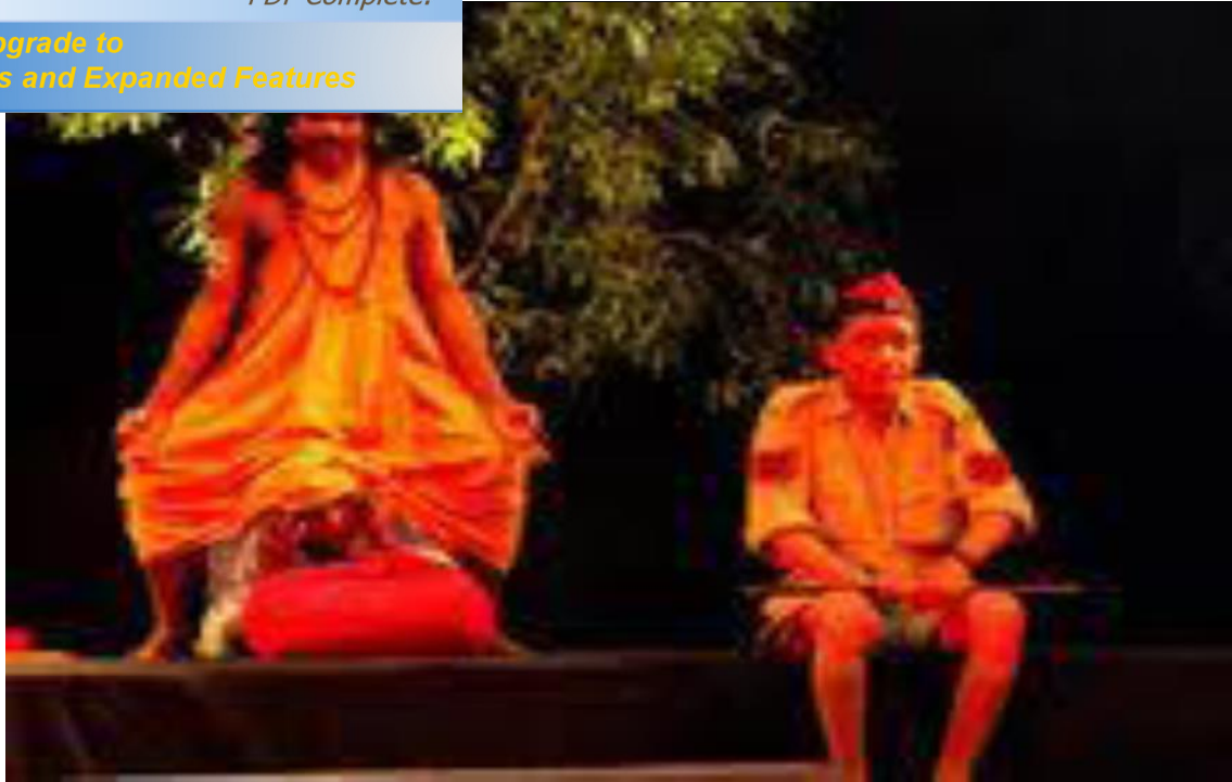
A scene from Charandas Chor by Habib Tanvir