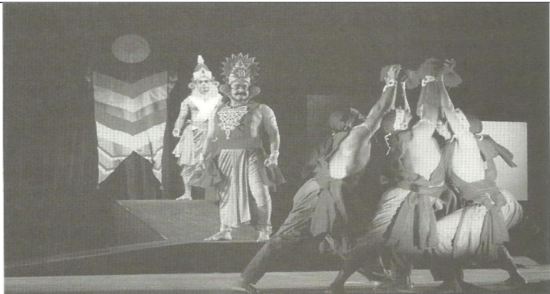
Karnabharam by K N Paniikar performed by Mohanlal