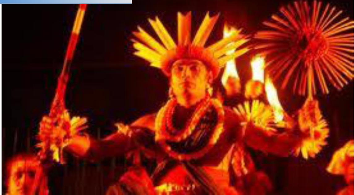
Karnabharam by K N Paniikar

Click Here to upgrade to Unlimited Pages and Expanded Features