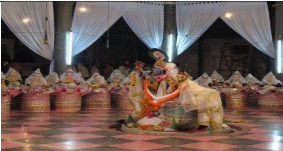
This is the original photograph of Manipuri Raas. In above photo of Play When we Dead Awaken has the same looks as in original.