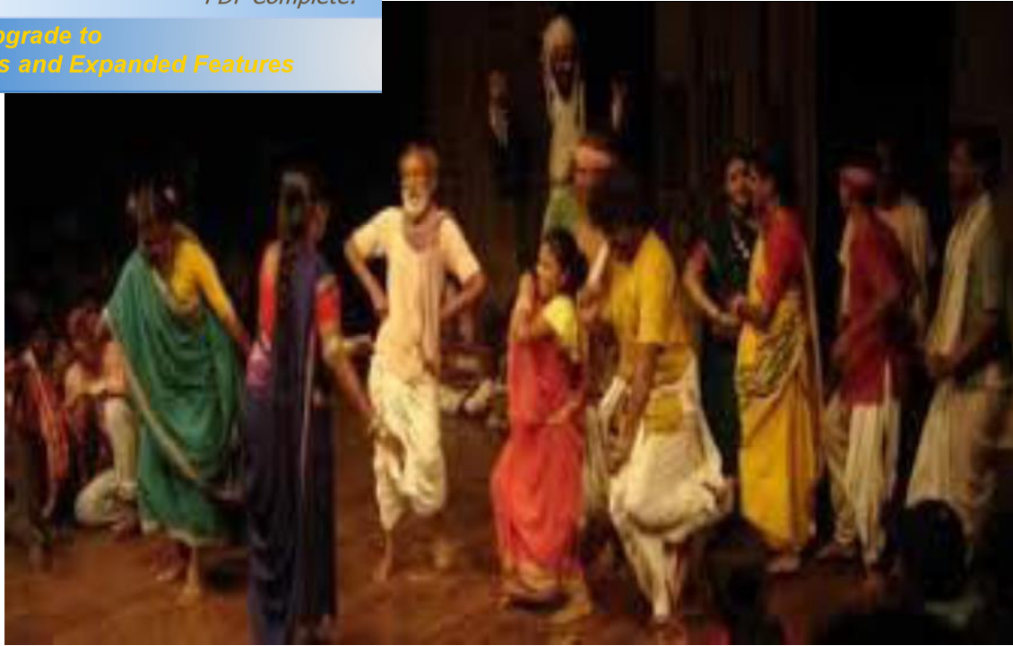
A scene from Charandas Chor by Habib Tanvir used a Nacha Folk form