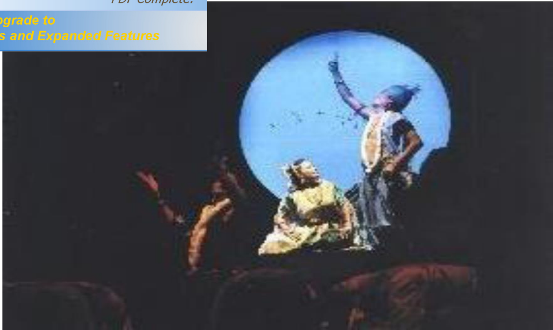
The aesthetical use of light and posture in a play Chakravuyh by Raan Thiyam

Click Here to upgrade to Unlimited Pages and Expanded Features