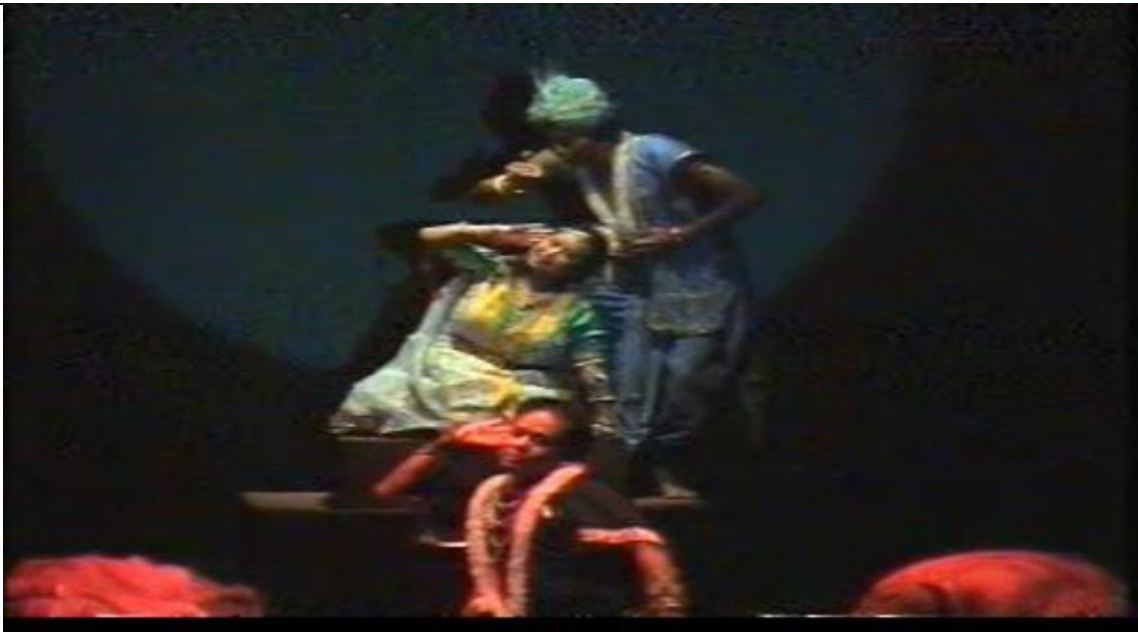
Natyashashtric Hand Gesture's and movement of Than Ta use in a play Chakravyuh by Ratan Thiyam