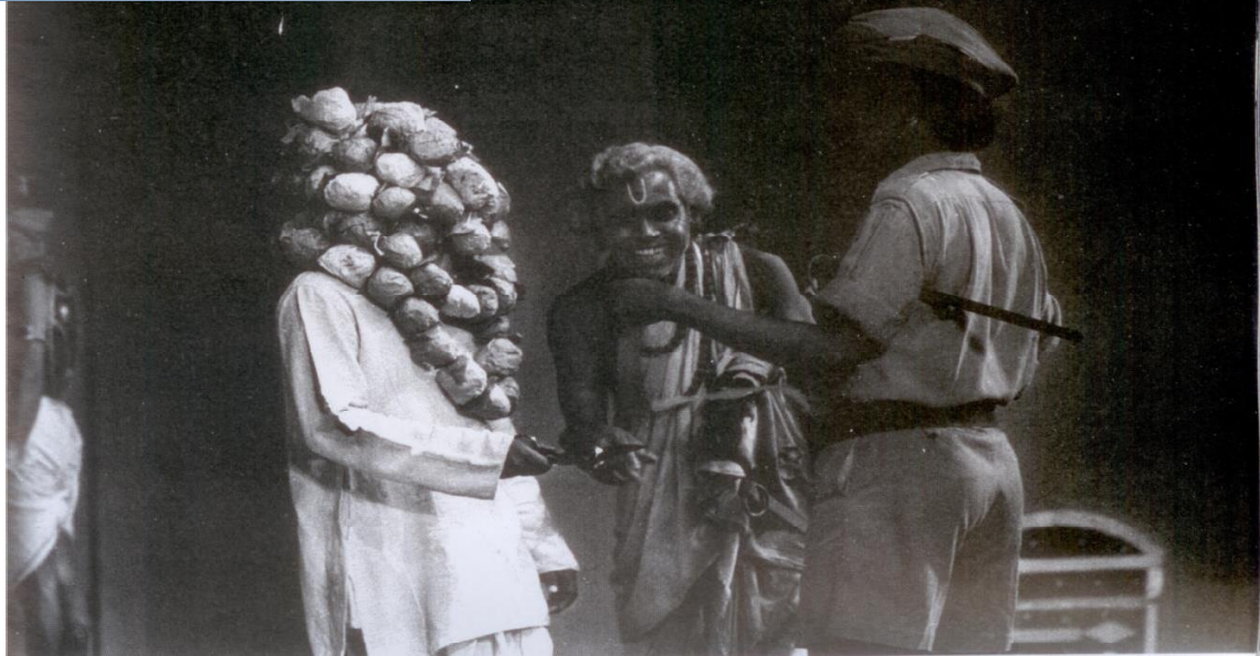
A scene from Charandas Chor by Habib Tanvir