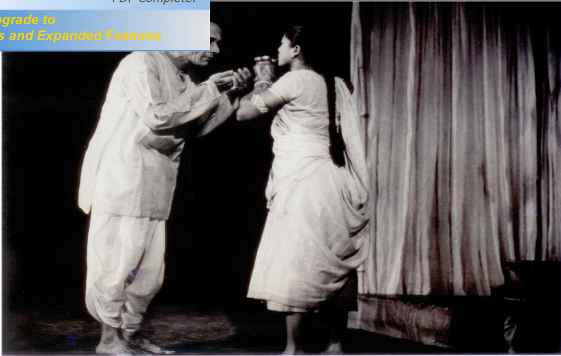
A scene from Bahadur Klarin by Habib Tanvir