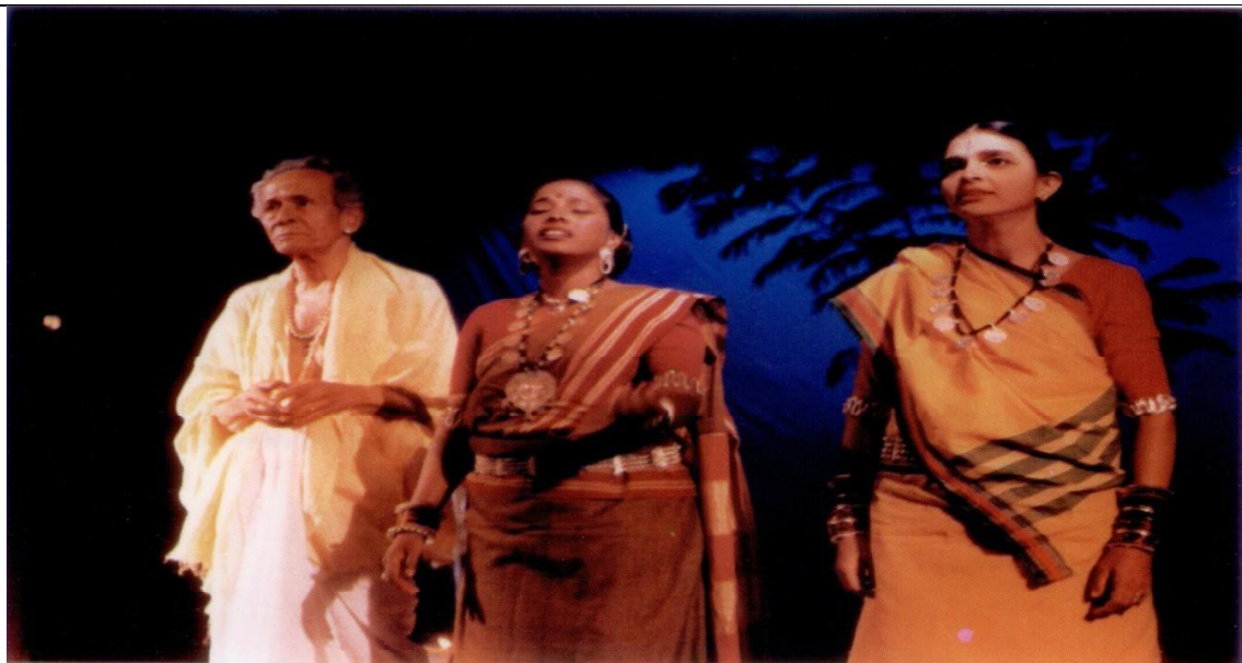
A scene from Charandas Chor of Habib Tanvir