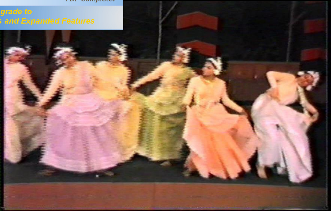
A scene from Urubhangam by K N Panikkar use of Mohiniattam

Click Here to upgrade to Unlimited Pages and Expanded Features