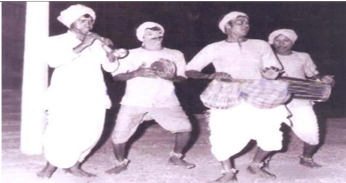
Original Performance of Nacha Folk which reflect in Agra Bazar