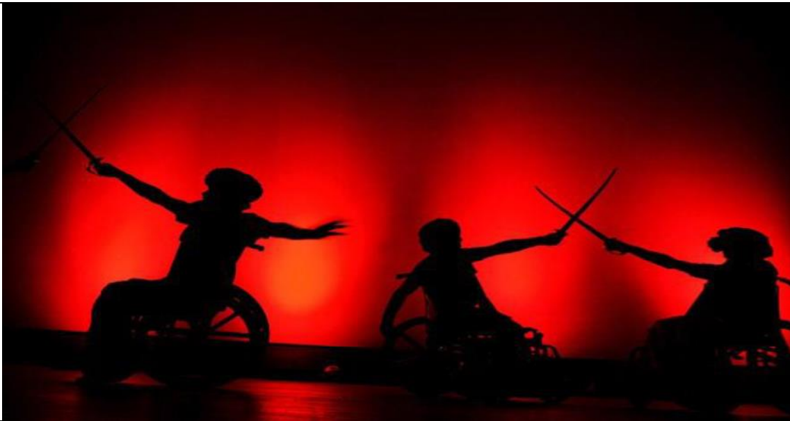
Original Thang Ta performance Movement which is reflect in the above play Chakaravuyh 's photo.