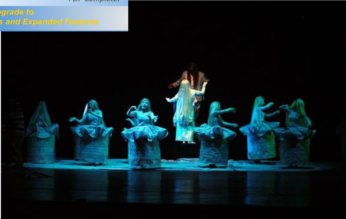
Composition of play “When We Dead Awaken “ when they go to heaven by Ratan Thiyam