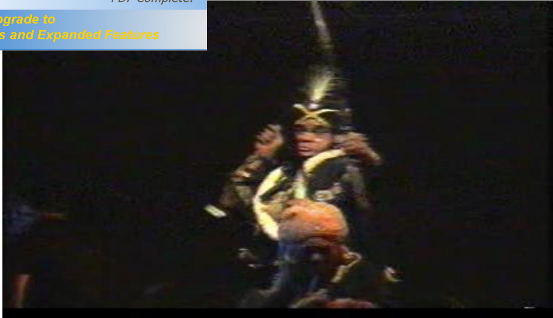
Thang Ta movement used in a play Chakravyuh by Ratan Thiyam