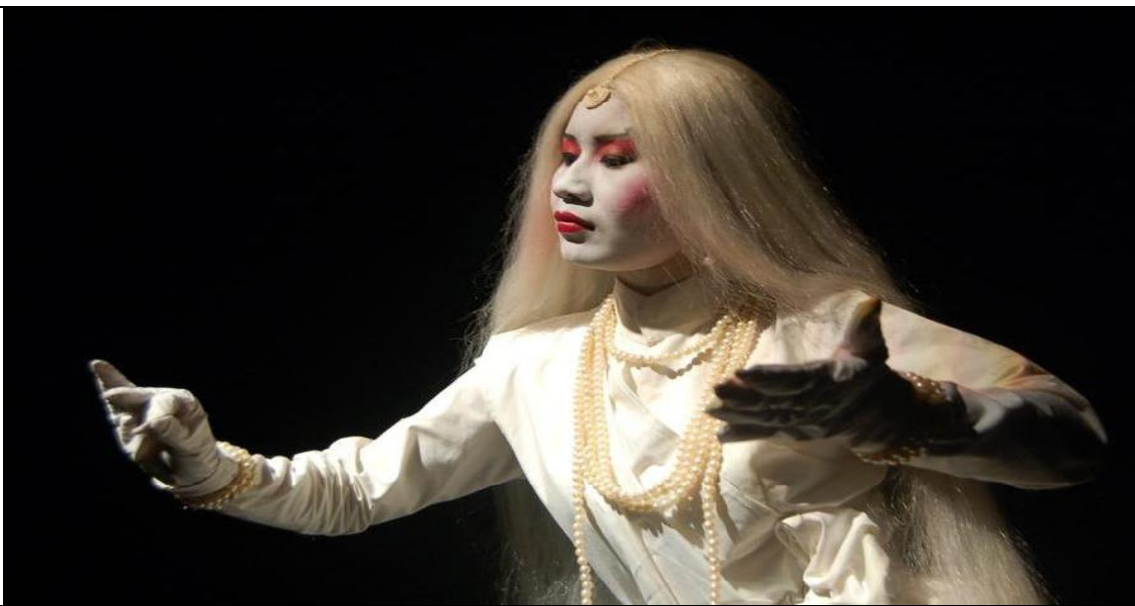
Natyashastri Hand Gesture's use in a play When We dead Awaken by Ratan Thiyam