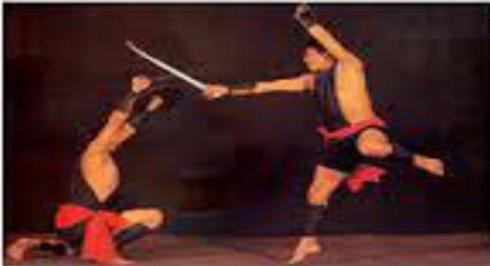
Original Thang Ta Movement which is reflect in the above play Chakaravuyh 's photo .