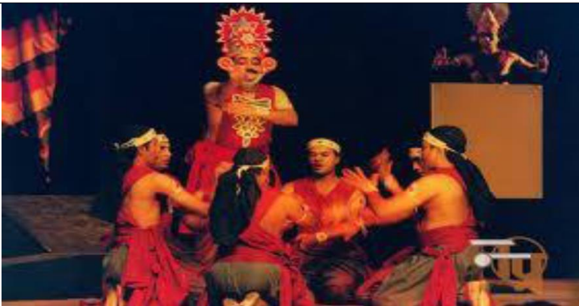
Karnabharam by K N Paniikar performed by Mohanlal