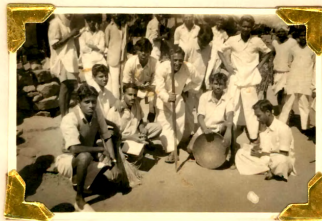
READY FOR SOCIAL WORK