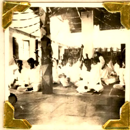
SILENT SPINNING BY STUDENT TEACHERS