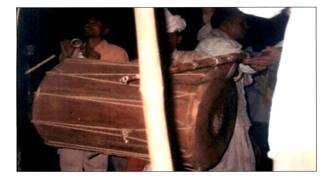
Tabla and Dhol