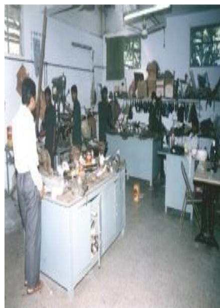
The trust provides various types of aids and appliances to the physically disabled. The picture shows our Orthotic and Prosthetic workshop which makes the appliances.