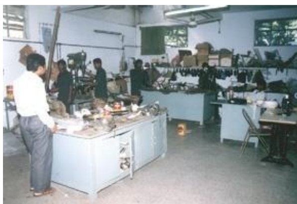
The trust provides various types of aids and appliances to the physically disabled. The picture shows our Orthotic and Prosthetic workshop which makes the appliances.