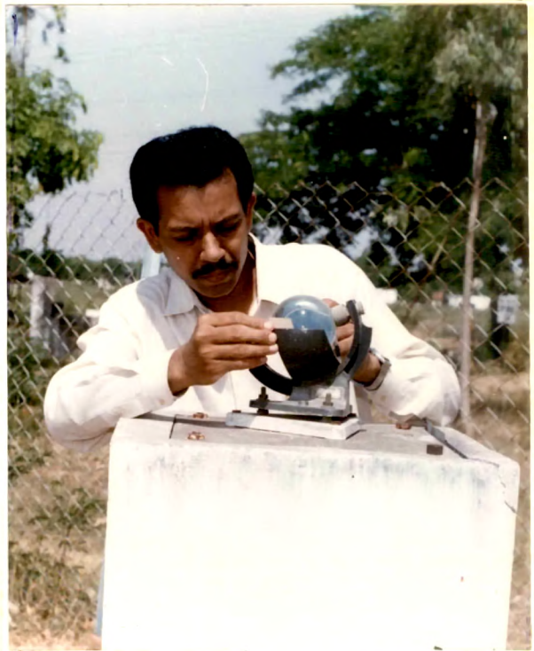
Sun Shine Recorder