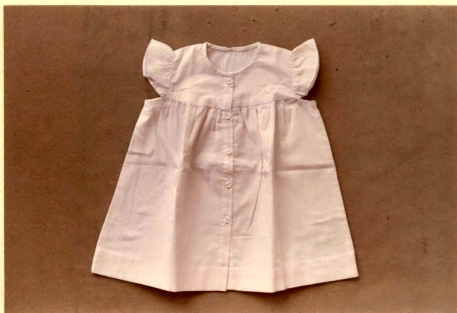
Plate 3 : Second garment stitched during experimentation.