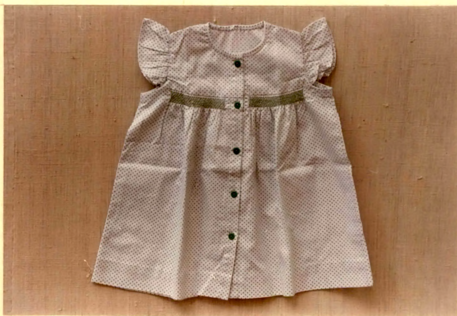
Plate 2 : First garment stitched during experimentation.