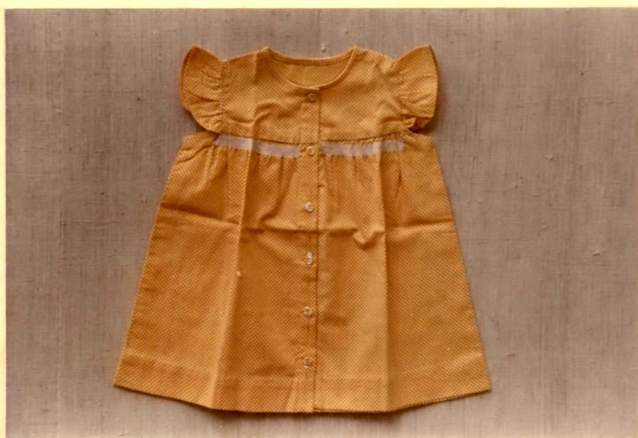
Plate 1 : Garment stitched during individual try-out.