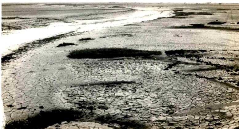
16 - Innundation of Kharland by the ingress of sea water (village Zamdi).