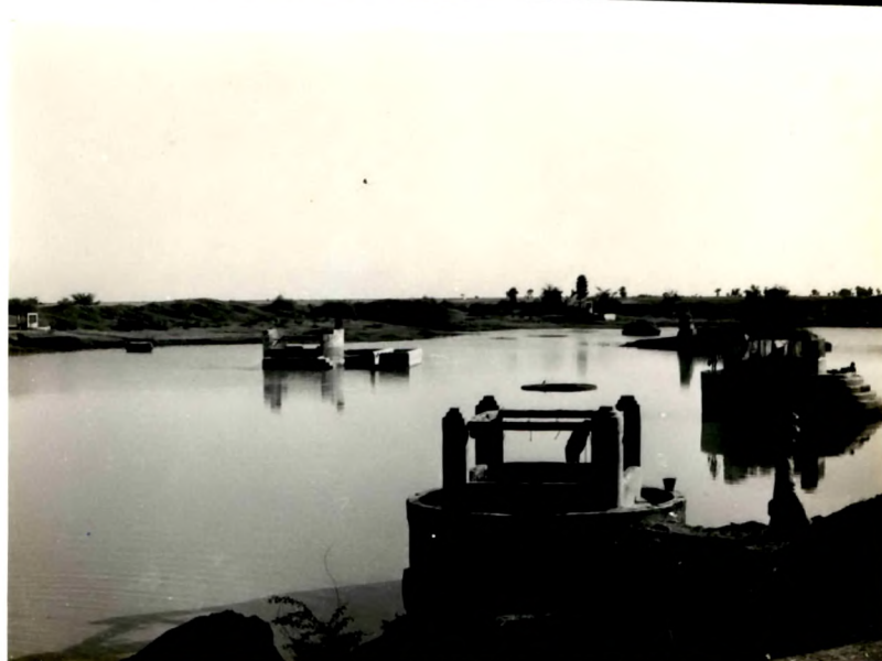
13 - A tank with seven seepage wells (village Nada).