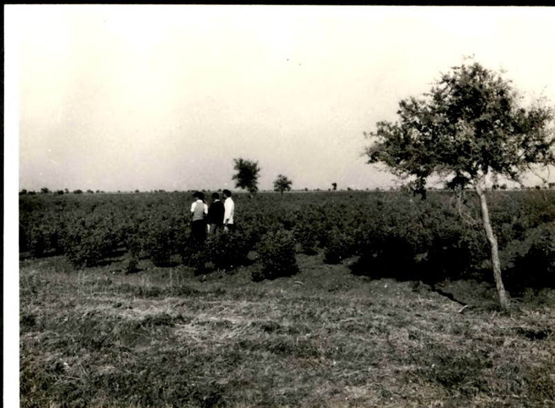
2 - Field with Gujarat Cotton-11 crop (Village Panchpipla)