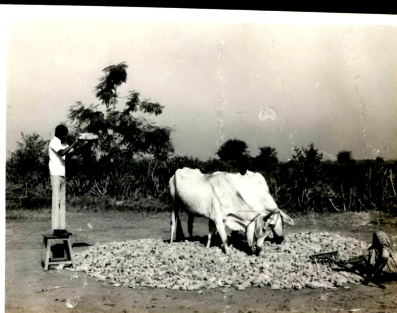
14 - Barn(Khali) Village Mahapura