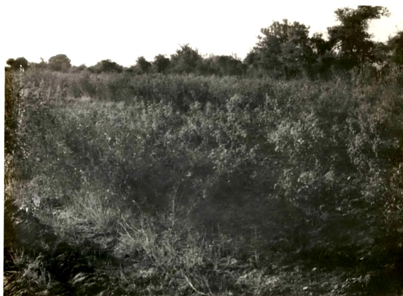
12 - Cotton field near Bhadkodara and Malpur.