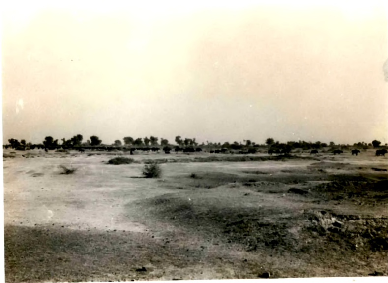
5 - Padtar (cultivable waste) with grazing animals in the background (village Kalak).