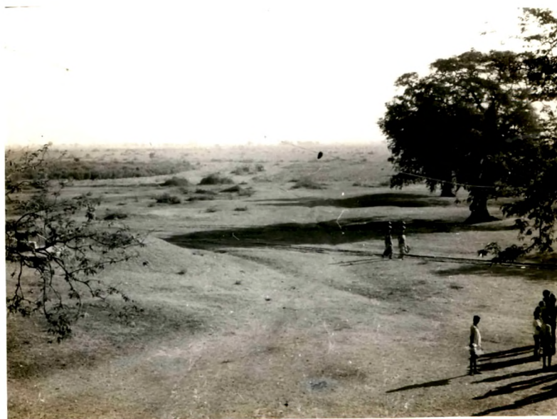
6 - Barren uneven land (village Kundhal)