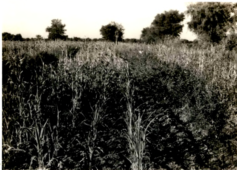
11 - Jawar and Tur rows (village Limaaji).