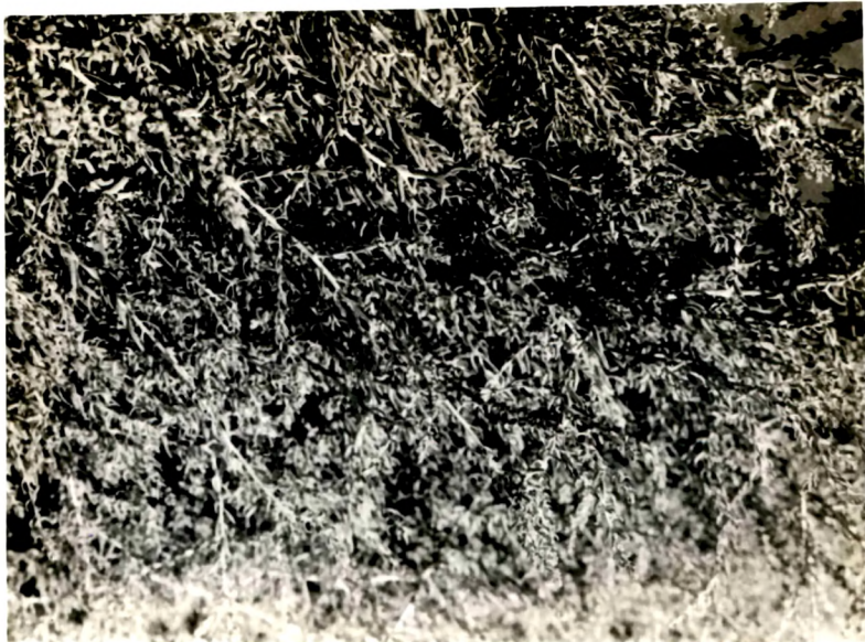
17 - Luni grass near the coast (village Zamdi)