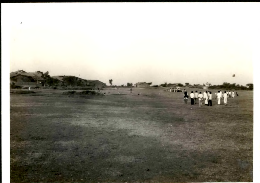
4 - Reclaimed creek area (village Madafar).