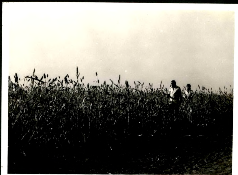
3 - Jowar field (village Vad).