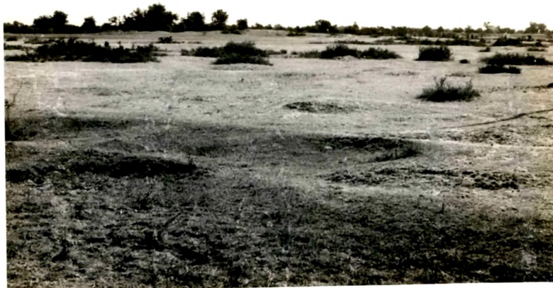
15 - Gauchar (Pasture land) at Village Kava