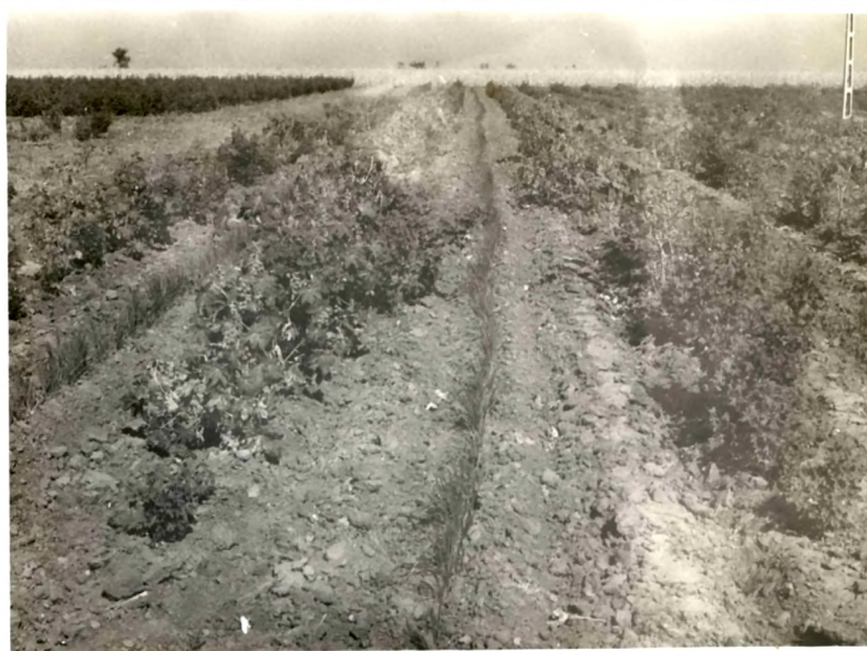
9 - Rows of Cotton-Castor and Wheat (village Thakor Talaodi).