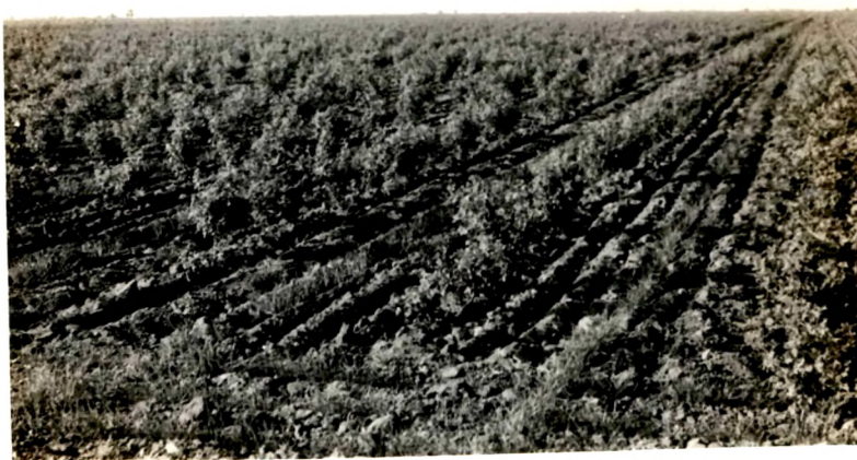
10 - Tur and cotton rows (village Limaji).