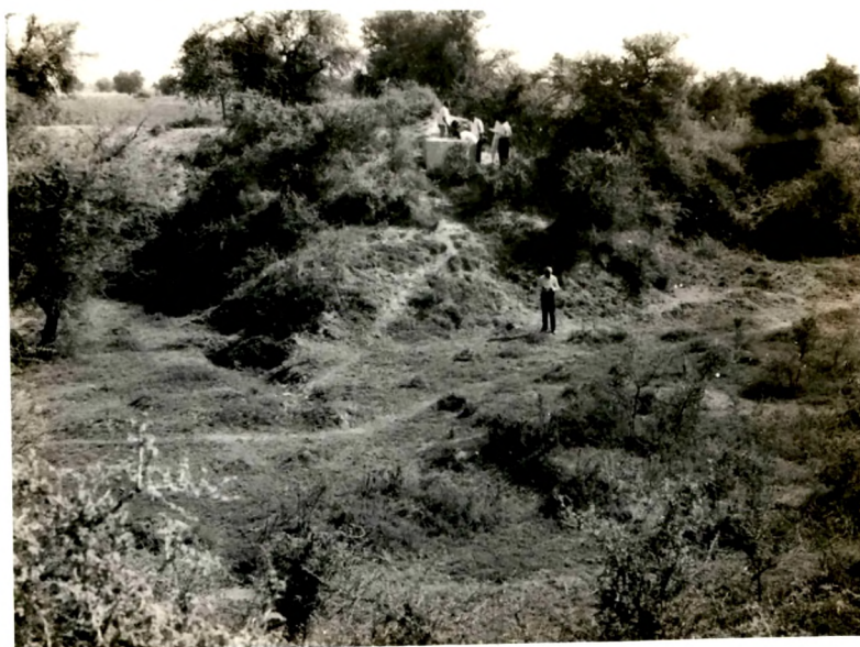
18 - Dry tank of village Chandpur Marva.