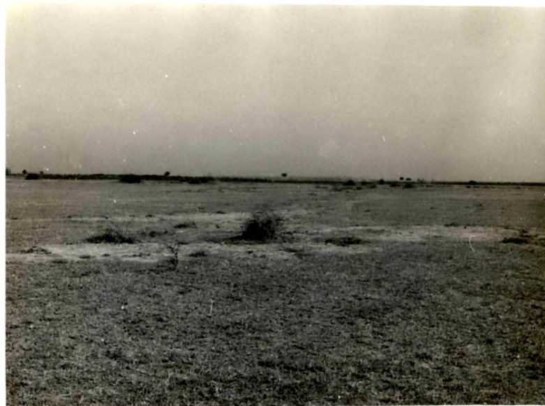
7 - Kharland with salt encrustation (village Khanpur Deh).