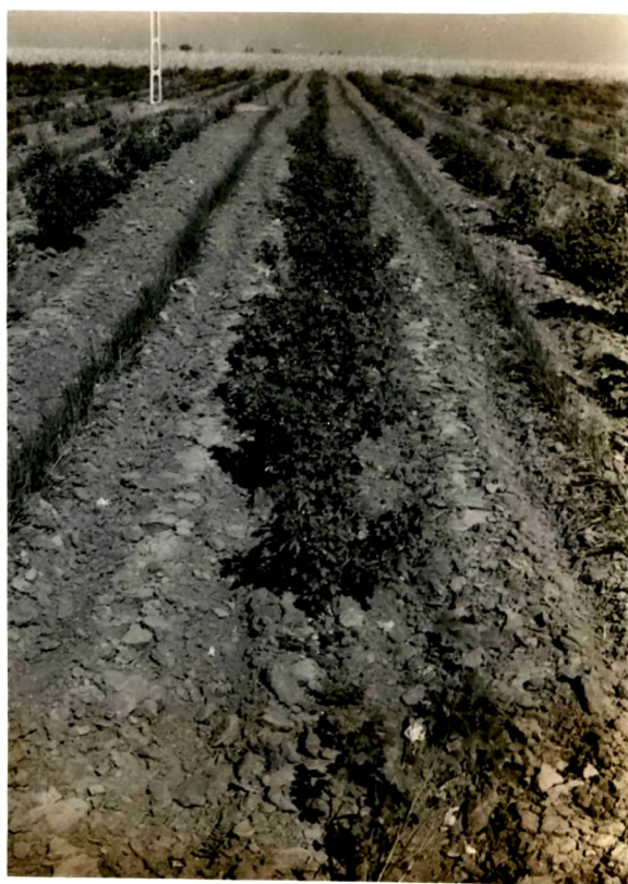
8 - Alternate rows of cotton and wheat (village Thakor Talaodi).