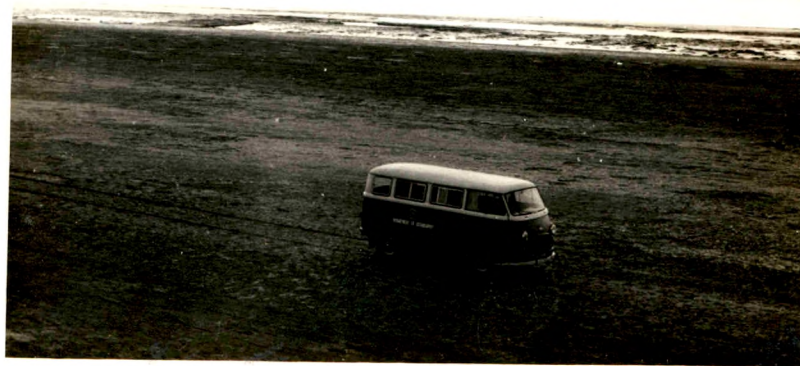
20 - Silting of the Gulf of Cambay off the Mahi estuary near Dehgam.