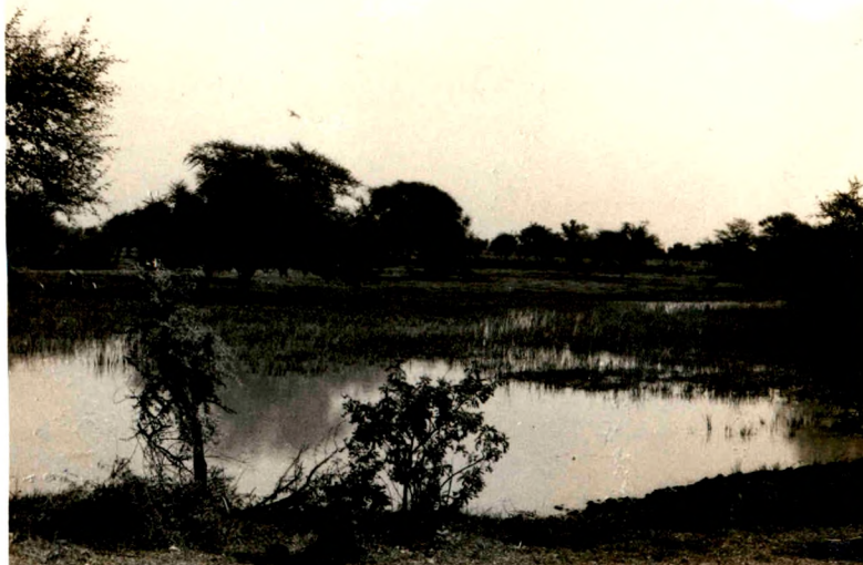
19 - Water logging ( village Salehpur Sangdi).