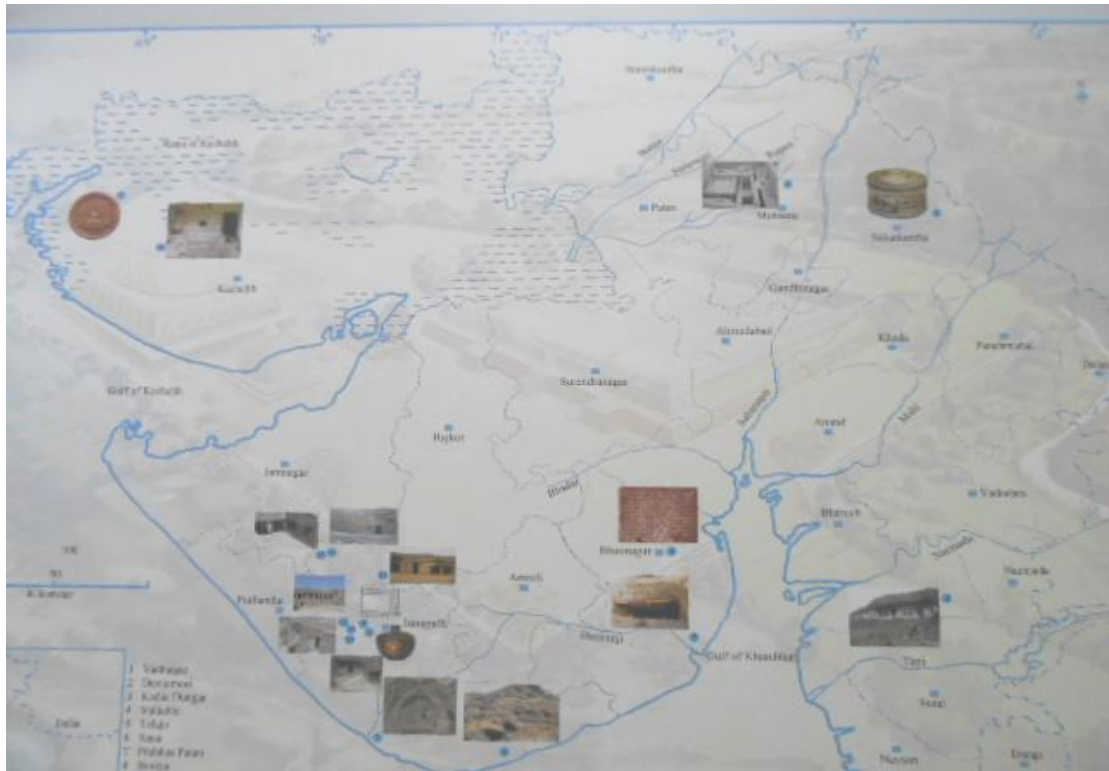
Fig.6.3, Buddhist sites of Gujarat