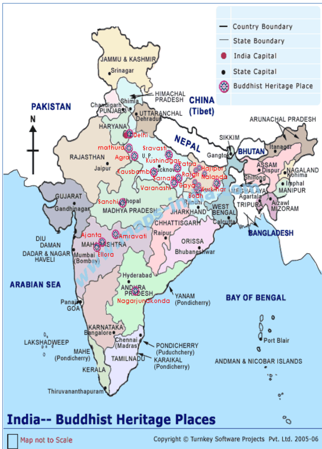
Fig.6.1, Bhuddist sites of India