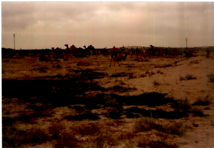
Plate I.2 A view of camel herd characteristic of desertic terrains of the study area.