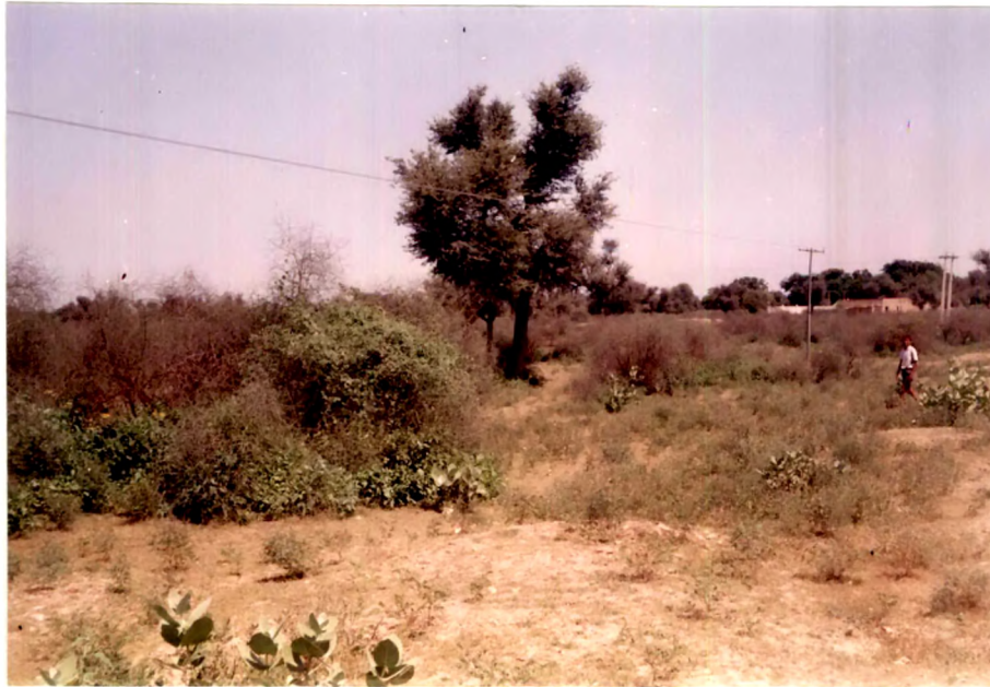
Plate I.1 Field photograph depicting typical thorny, shrubby vegetation. Location: Budsu