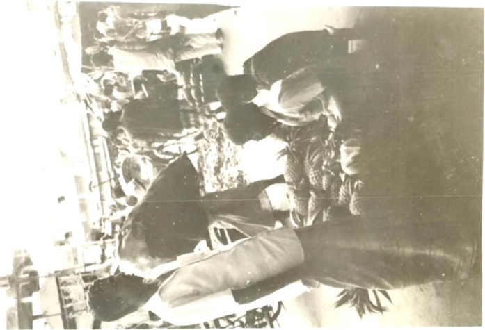
Plate 5 : Rajabazar - Fate ali bazar Road, Encroachment by fruit sellers.