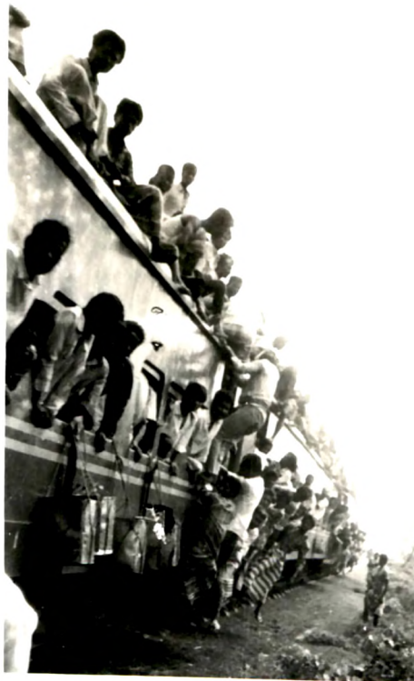
Plate 10 b : Supply of Milk in tin container.