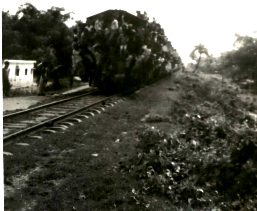
Plate 10 a : Commuters flow from East Bogra.