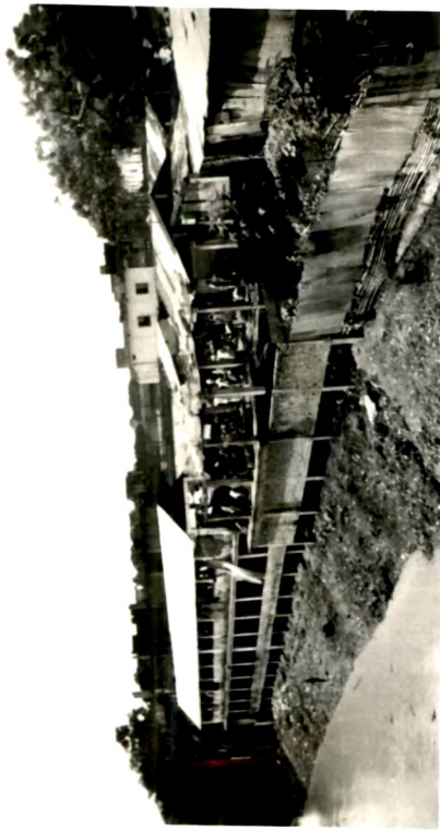
Plate 3 : Rear View of Fate ali bazar (Vegetable, Fish, Grocery).