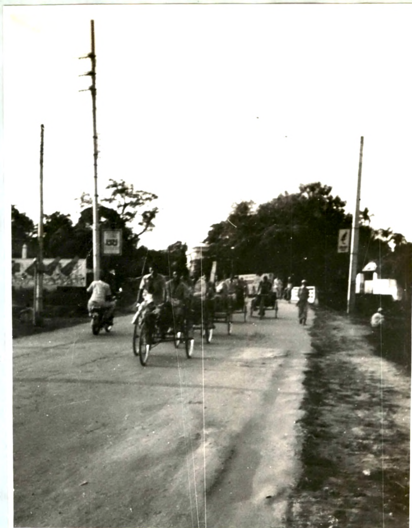
Plate 12 : Saria Kandi Road; Rickshaw and Rickshaw-van for passengers & goods.