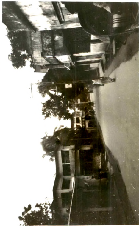
Plate 8 : Recent constructions in Maloti-nagar residential area.