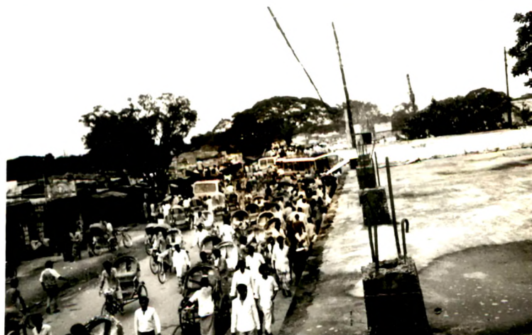
Plate 2 : Station Road - Bus and Truck Terminals near CBA; normal traffic.