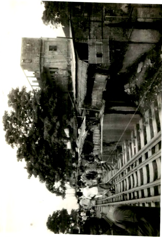
Plate 4 : Rear View of Rajabazar, Vendors on Railway Track.