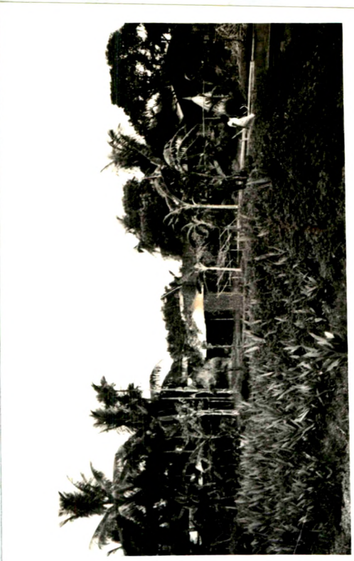
Plate 15 : Malgram extension area - rural environment.