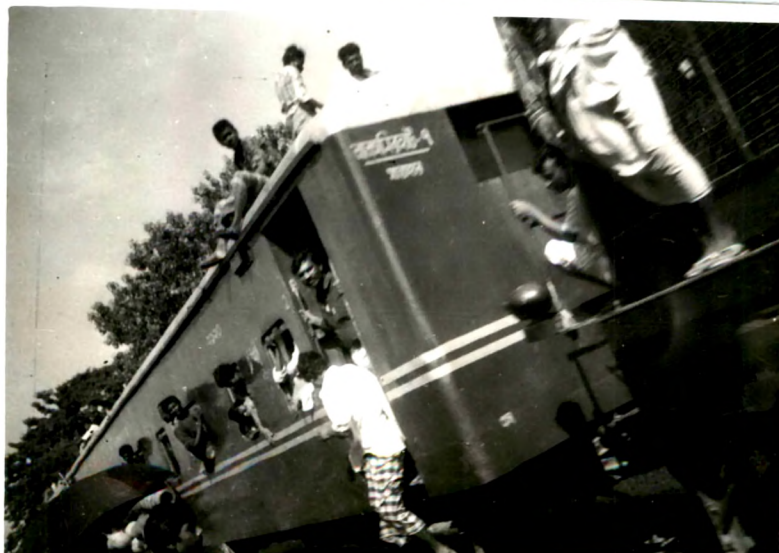
Plate 11 : Commuters from West Bogra.