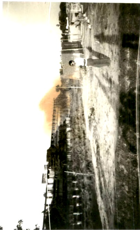
Plate 9 : Women's College Located on the Bank of 'Subil Khal'; Earth filling in low lying area.