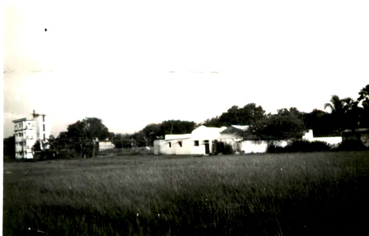
Plate 13 : Malgram extension area. New houses interspersed with paddy field.