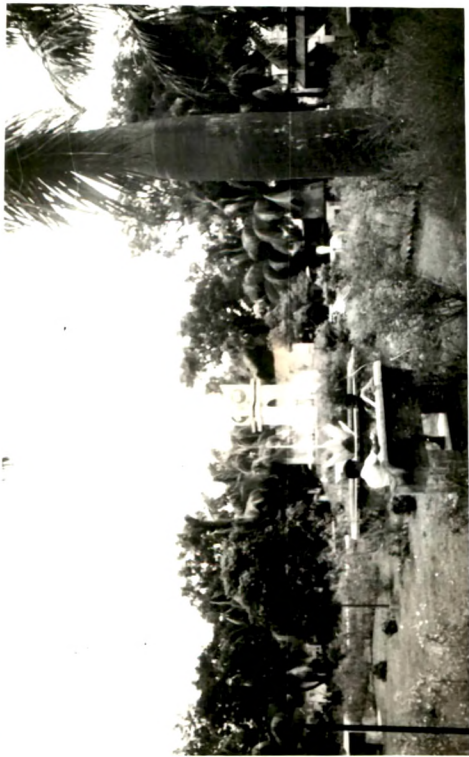
Plate 6 : Mini-Park within southern limit of CBA.