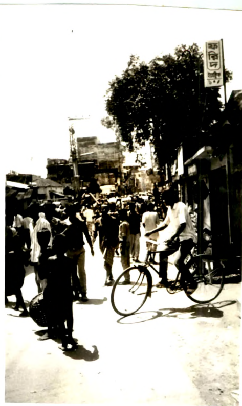
Plate 1 a & b : Views of Main Road within CBA.