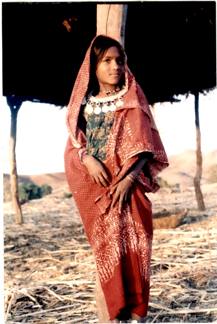
Unmarried, Young and Married Wearing Style