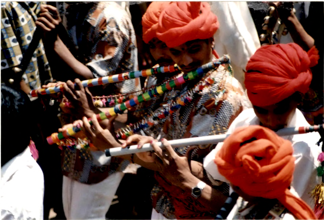
Shirt Style – Police Uniform