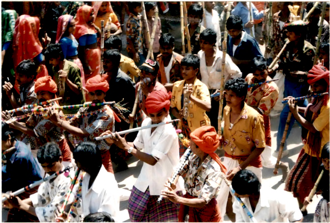
Men turben Style