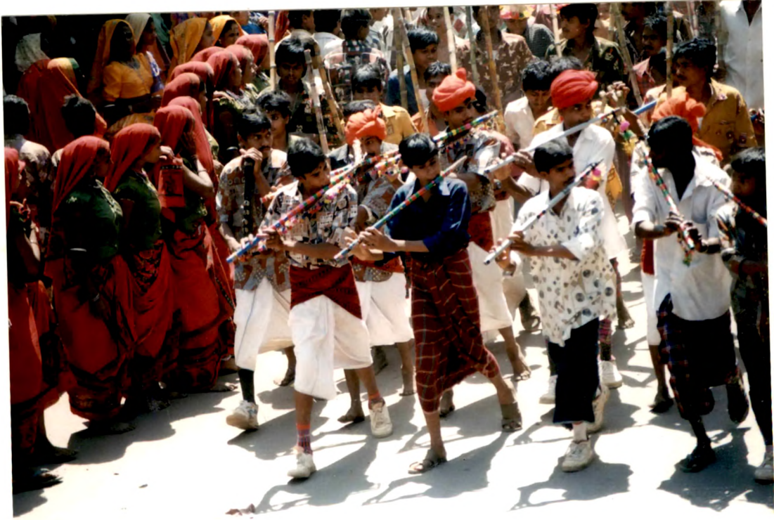
Male and female dressing style