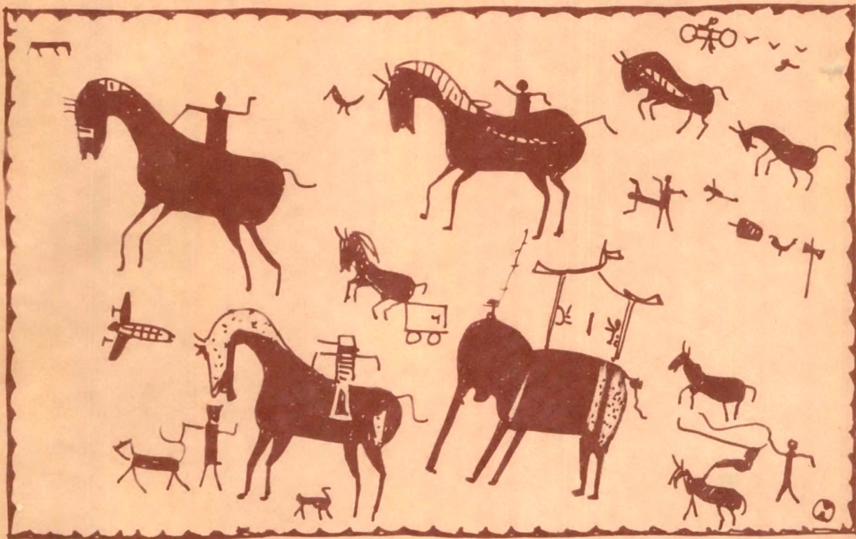
A WALL PICTURE OF PINDHORA DEITY WORSHIPPED BY THE RATHAVA TRIBE OF HALOL, BARIA AND JAMBUGHODA TALUKAS OF PANCHMAHALS DISTRICT.