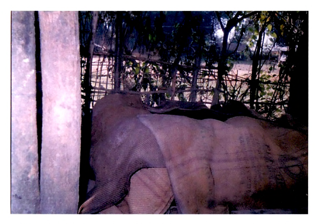
Photo V.3 The pots containing rice are being covered for proper fermentation