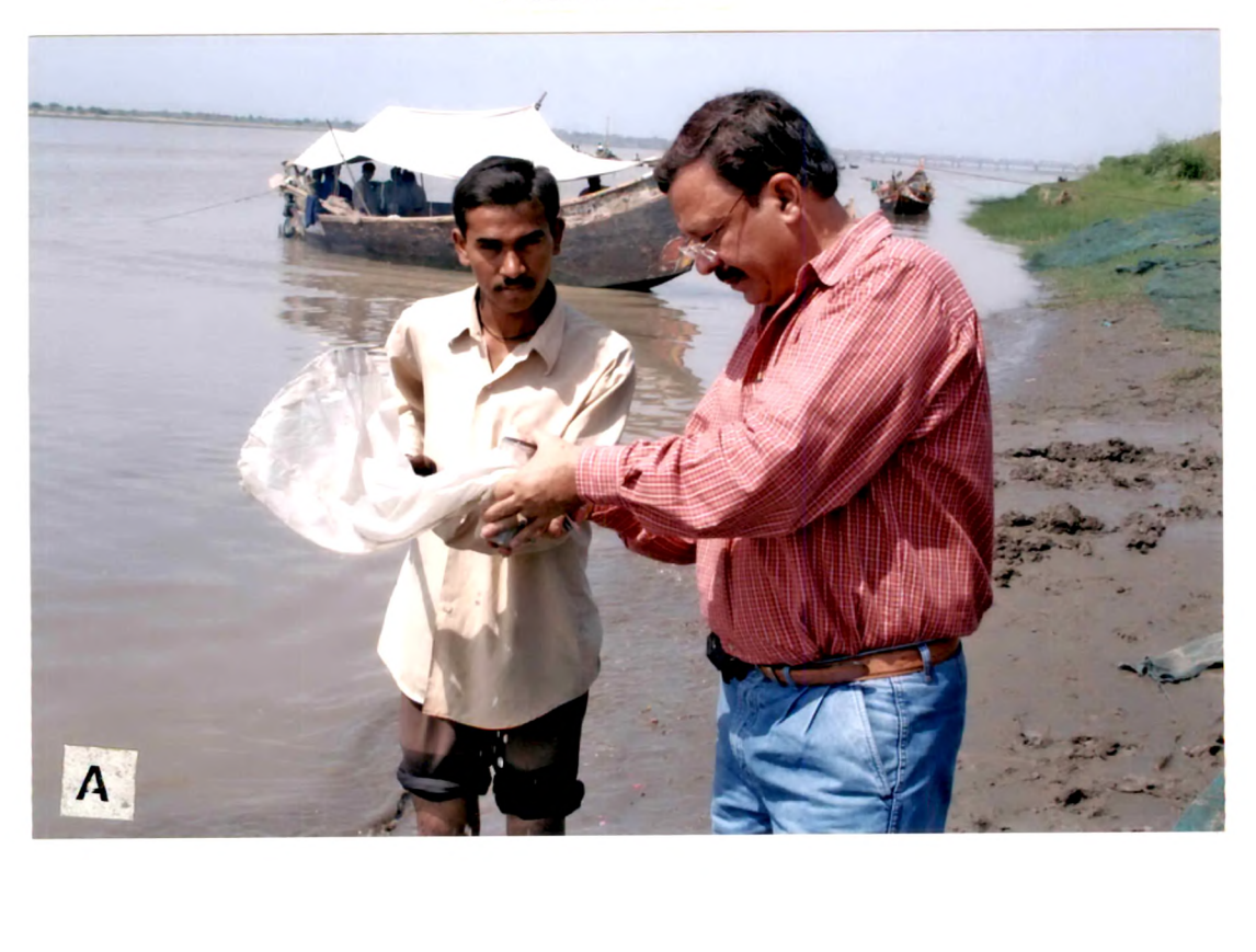
Plate - 5