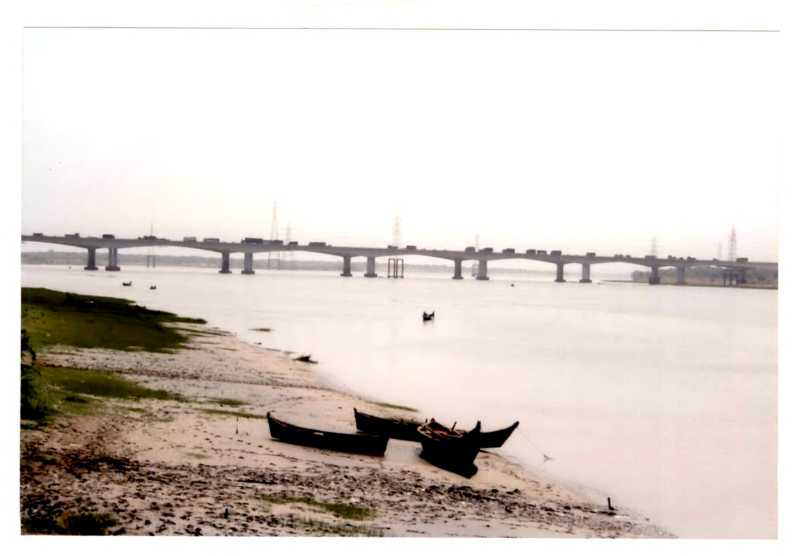
Plate - 4