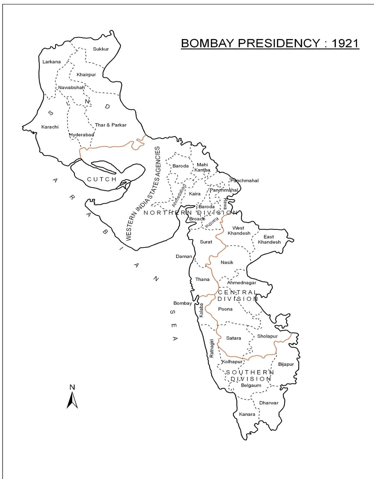
Map No. 1