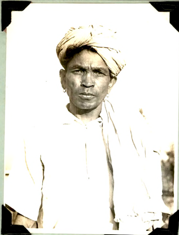
An old Kunbi Male