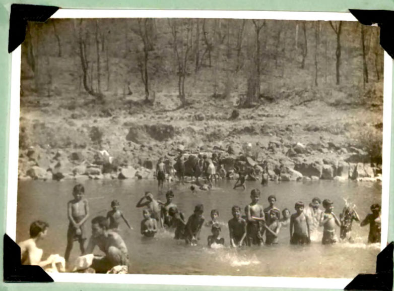
Bath in a river