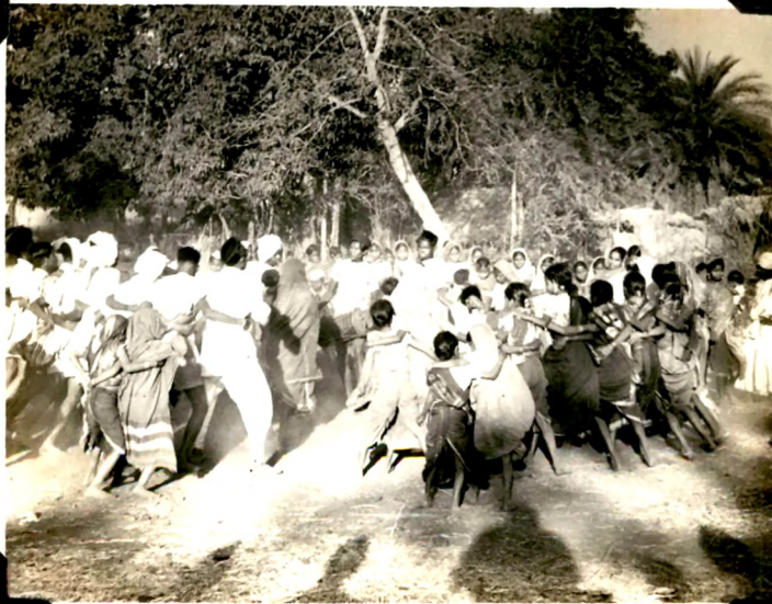
A Group Dance