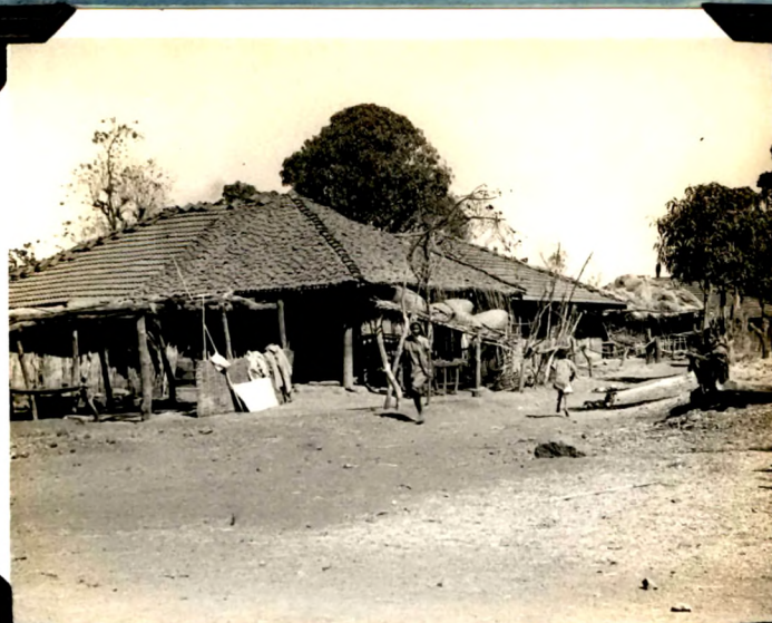
A street of a Dangi village