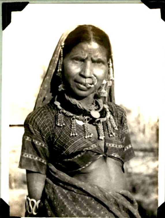
An old woman