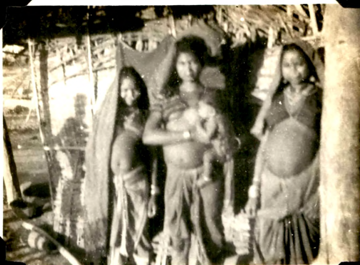
A Mother, Her Daughter And Daughter-in-law