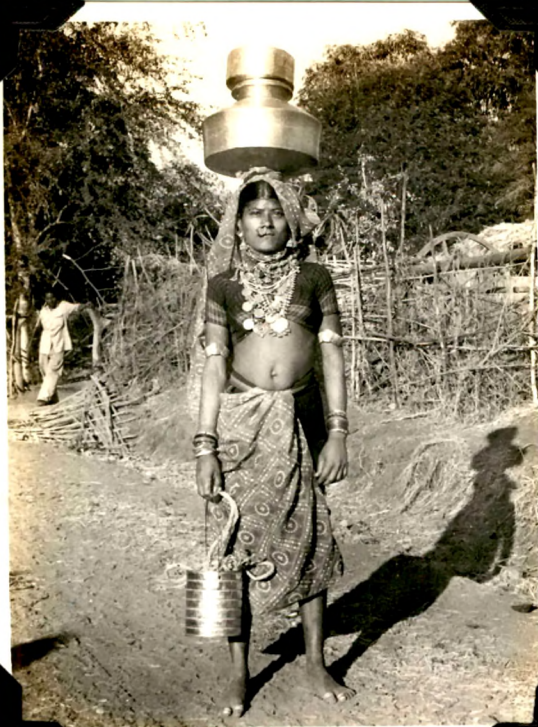
A young girl going for fetching water