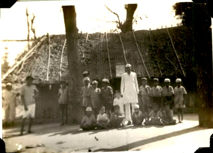
A village primary school, its teacher and pupils