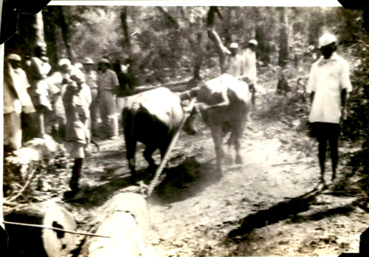
He-buffaloes dragging a log