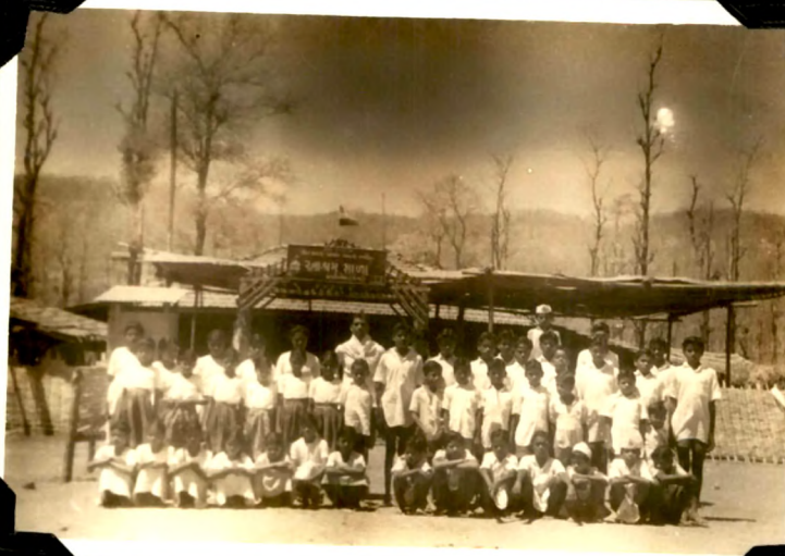
Ashram School, Kalibel. (Old building)