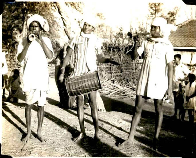
Playing on a Dholak and a Kahalya