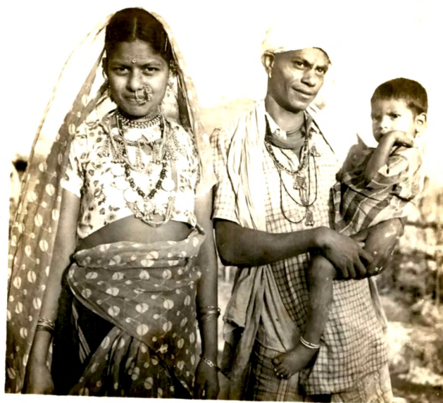
A young couple with its child