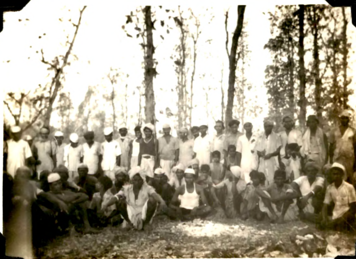
A group sharing a hunt