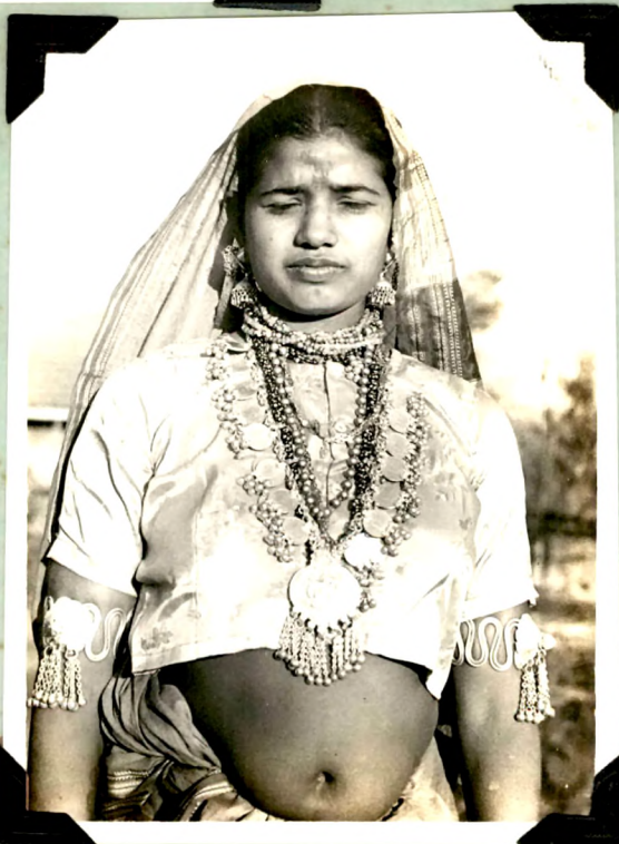
A newly married girl