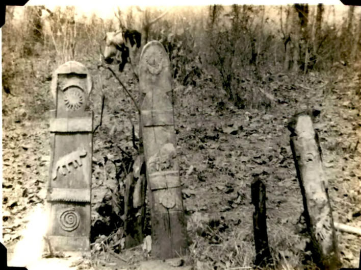
Gods carved on a wooden plank