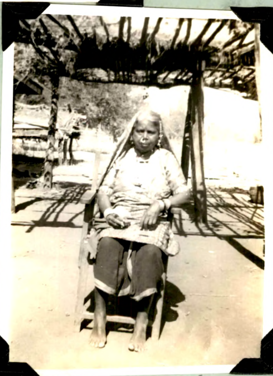
A very old woman