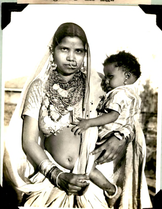
A Mother and Her Child