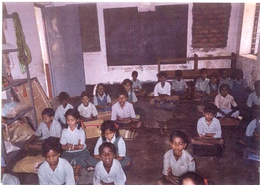
(E) Pupils of Group Three during a Thematic Drawing on Water