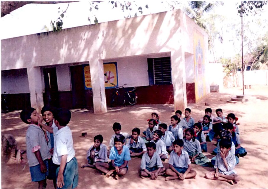
(c) Pupils of Group Three Performing a Drama