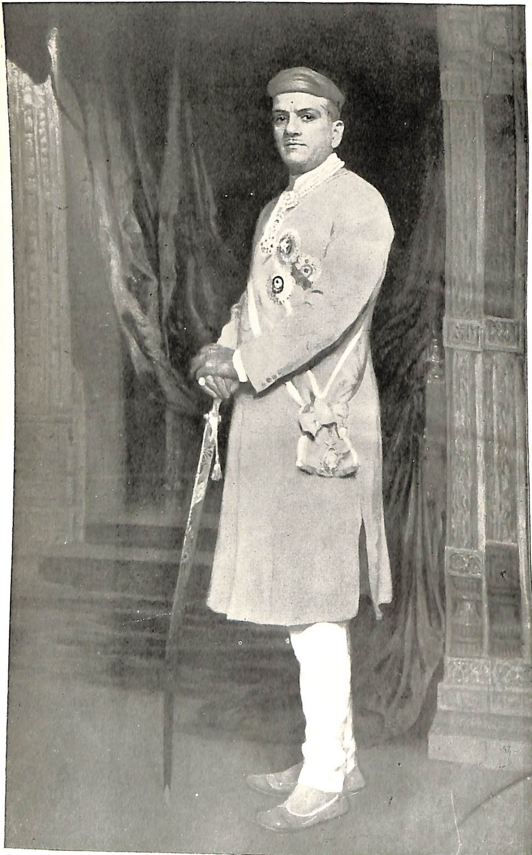
His Highness the Maharaja Sir Sayajirao Gaekwad of Baroda