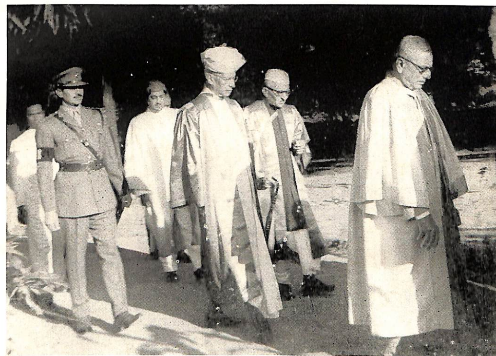
The Senate Procession